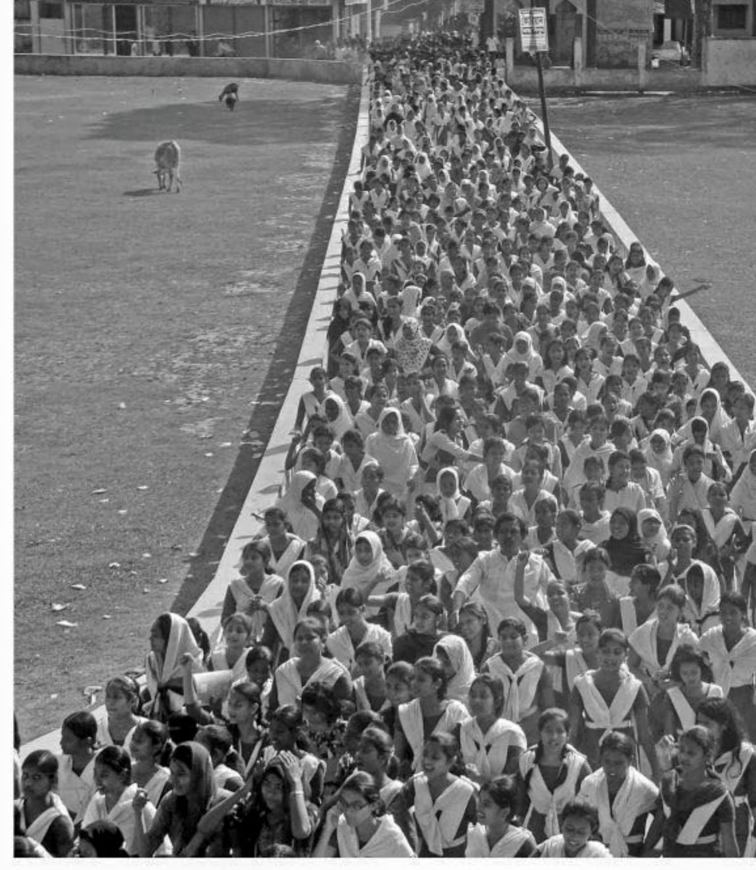
Journalists, teachers, students, freedom fighters and cultural activists stage demonstrations across the country yesterday demanding exemplary punishment to Jamaat-Shibir men and the activists of some like-minded radical Islamist parties, who attacked journalists, vandalised Chittagong Press Club and Shaheed Minars in Feni and Sylhet and torched the national flag in Chandpur and Bogra on Friday. Photos show 1) photojournalists hold a protest rally, keeping their cameras on a road in Bogra town, 2) journalists form a human chain in front of Rangpur Press Club, 3) journalists stage a sit-in on the premises of Munshiganj Central Shaheed Minar, 4) school students take out a procession at Bhuapur in Tangail, 5) teachers of Rajshahi University join a human chain on the campus, 6) Freedom fighters and cultural activists bring out a procession in Faridpur town demanding death penalty to war criminals, 7) students of Khagrachhari Government College demonstrate in the town demanding death sentences to war criminals, including Jamaat leader Abdul Quader Mollah, and 8) a man at Durgabari Road in Mymensingh town puts his signature on a paper, expressing solidarity with the six-point demand announced from Projoonmo Chattar at Shahbagh in the capital.