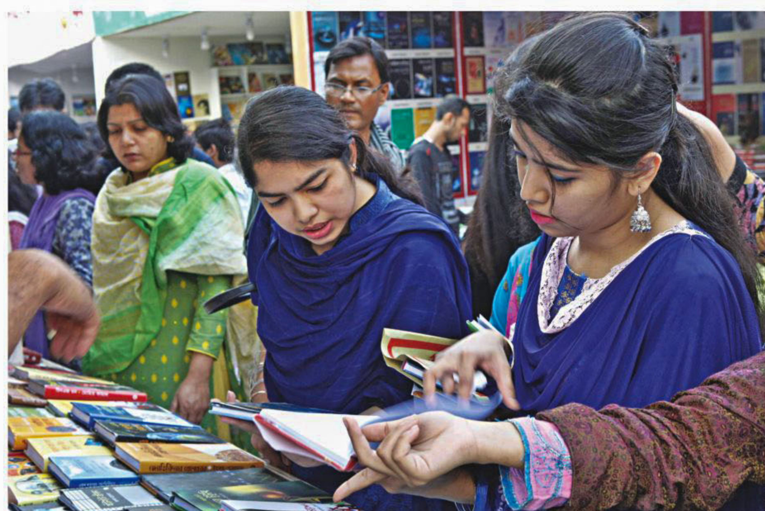
Book enthusiasts check out new arrivals at a stall in Amar Ekushey Boi Mela on the Bangla Academy premises in the capital yesterday.