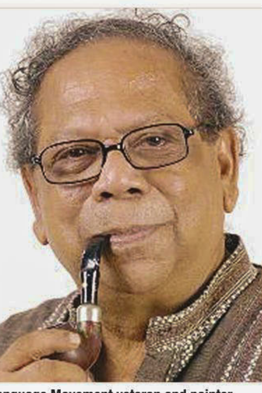
Language Movement veteran and painter Murtaja Baser will be honoured by Padatik.