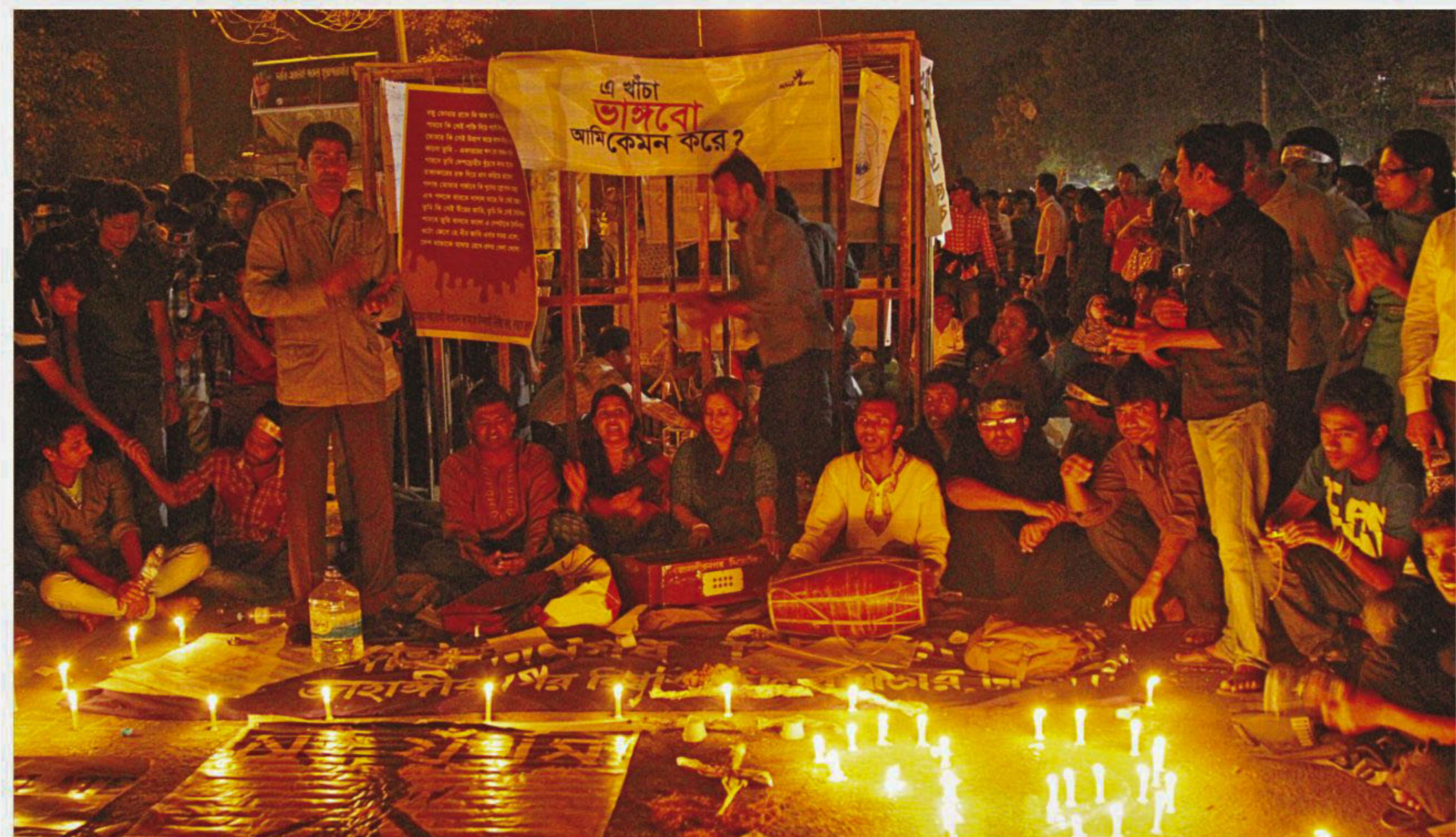
The recent protests in Shahbagh are a reassurance that the young can still raise their voices for the nation.