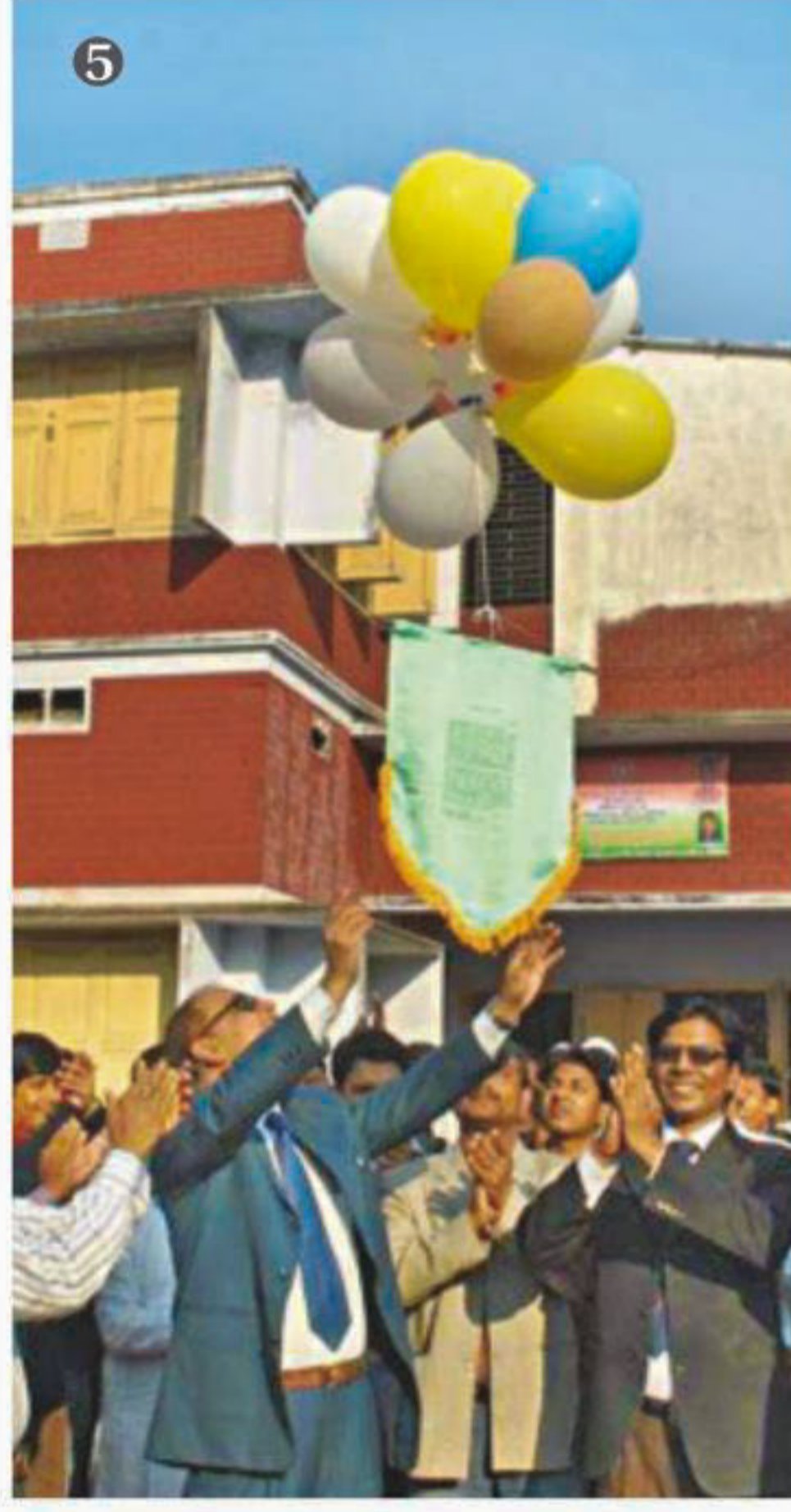
People send 'symbolic letters' to the 1971 Liberation War martyrs with flying balloons at 1) Modern Moar in Dinajpur town, 2) Satmatha intersection in Bogra town, 3) the premises of Chapainawabganj Government College, 4) Munshiganj town, and 5) the premises of Pabna University of Science and Technology, 6) Projonma '71 holds a rally on the premises of Government Huseyn Shaheed Suhrawardy College in Magura town and 7) Khelaghar forms a human chain in front of Manikganj Press Club yesterday, as part of countrywide programme expressing solidarity with the movement at Shahbagh in the capital demanding capital punishment to the war criminals including Jamaat-e-Islami leader Abdul Quader Mollah.