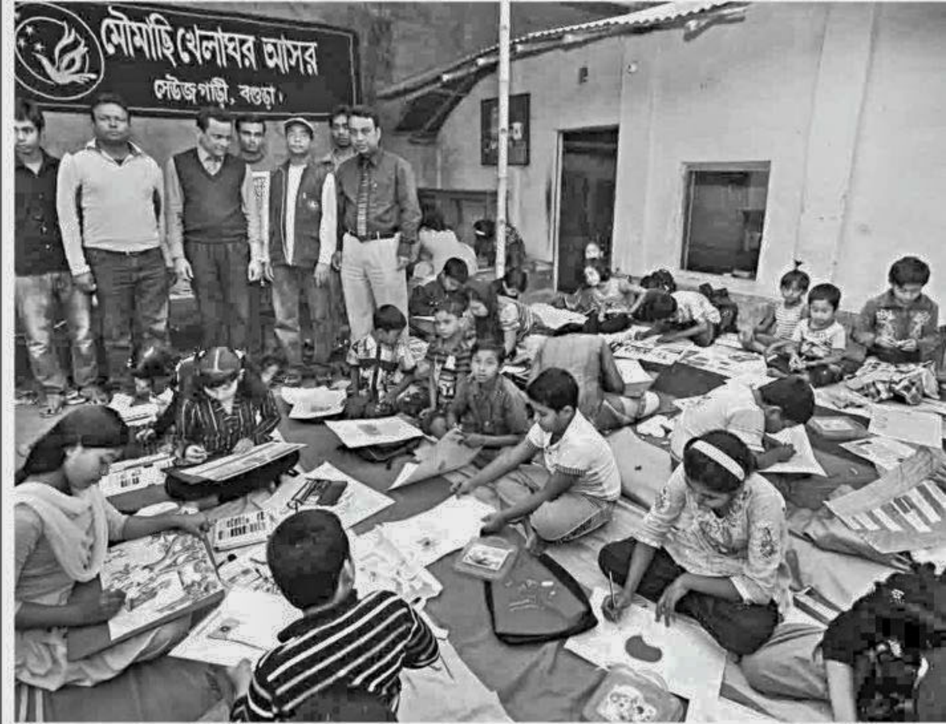
FROM TOP: A florist busy preparing wreaths at his shop in Dinajpur town, children participate in a painting contest organised by Moumachhi Khelaghar Asar on its office premises in Bogra town, and Chandpur district administration and municipality authorities jointly arrange a four-day book fair on the premises of the Central Shaheed Minar in the town yesterday.