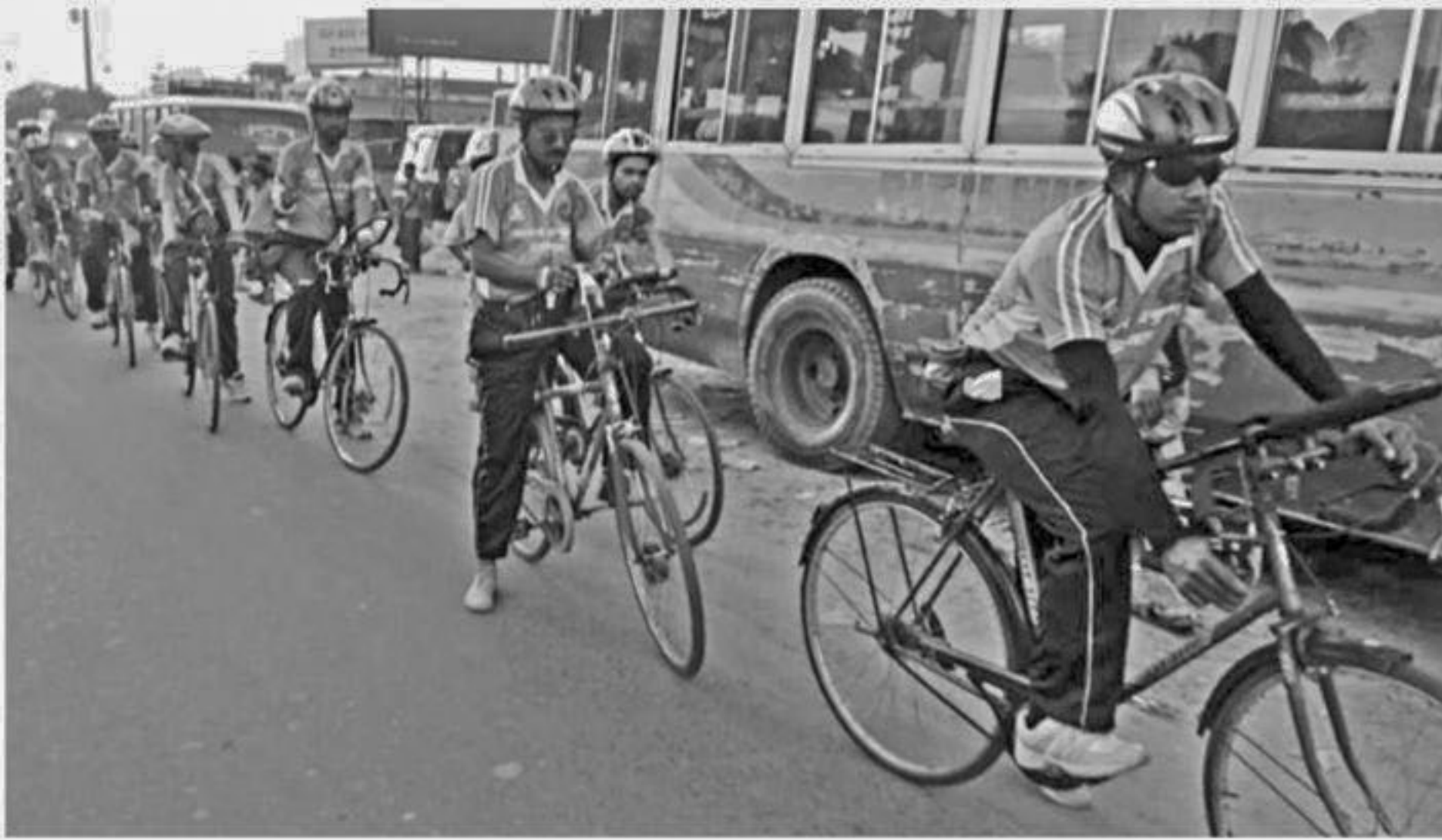
A team of Kolkata Football Lovers' Association, which reached Manikganj riding bicycles yesterday morning, left for Dhaka the same day. The team members will express solidarity with Shahbagh movement and place wreaths at the Central Shaheed Minar today. They will leave Dhaka for Kolkata tomorrow.