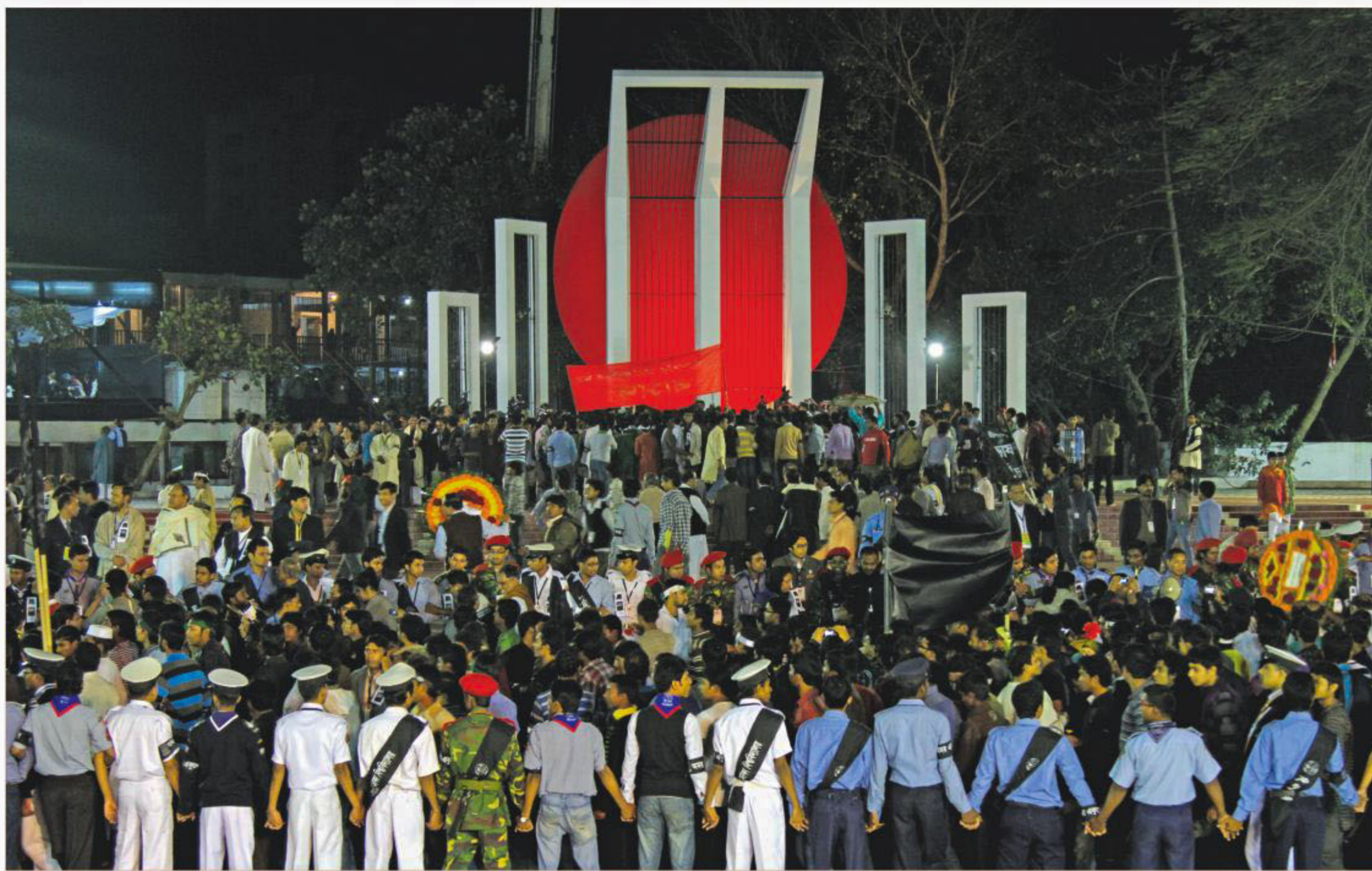
Crowds converge at the Central Shaheed Minar in the capital early today to pay homage to the martyrs of the Language Movement. More photos on page 2.