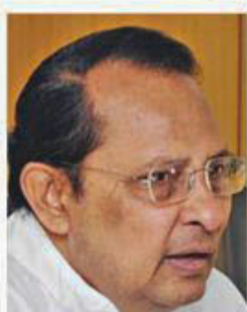
Hasanul Haq Inu

If any media outlet performs such practices, legal action will be taken against them, Information Minister Hasanul Haq Inu told