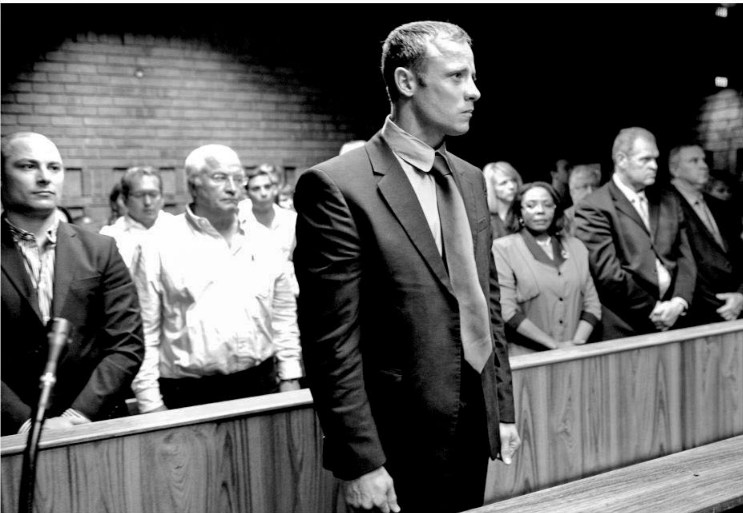
South Africa's double-amputee Olympian Oscar Pistorius (C) appears at the Magistrate Court on charges of murdering his model girlfriend Reeva Steenkamp in Pretoria yesterday.