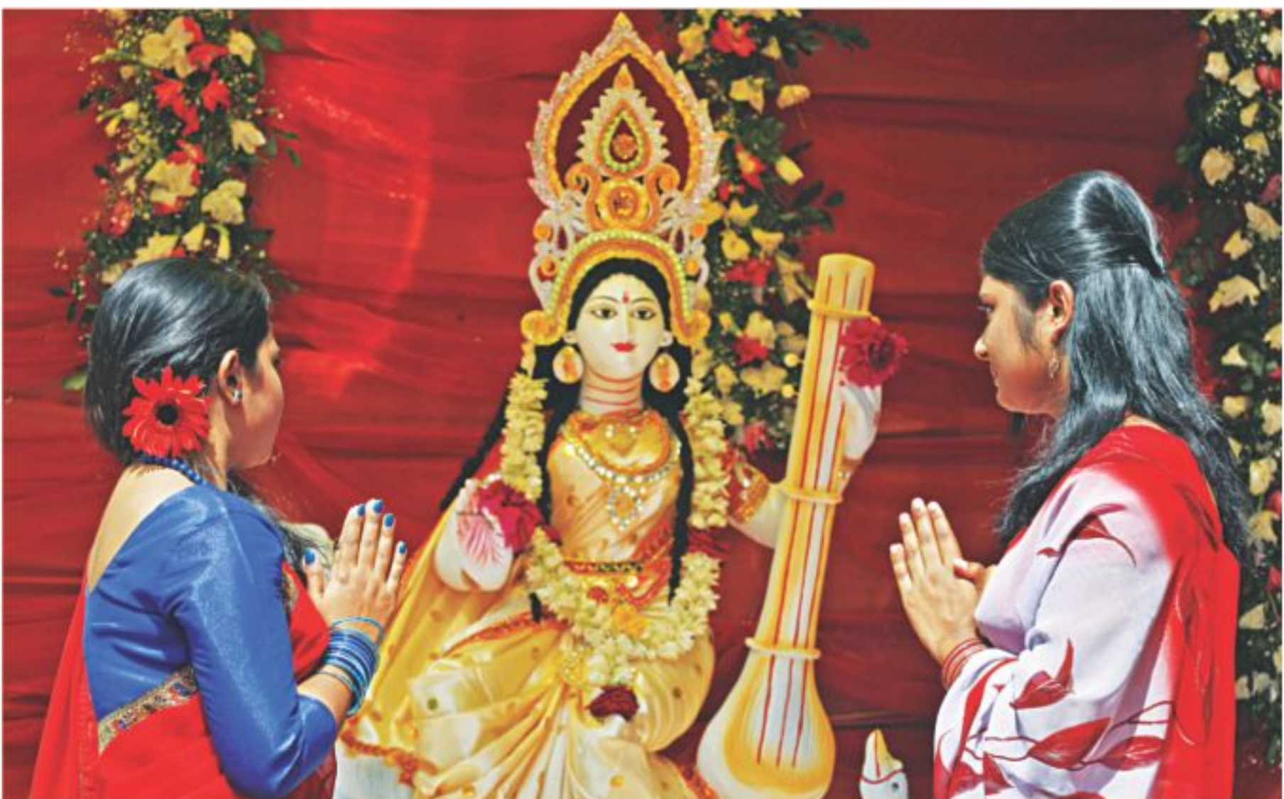
Two students seek blessings of the Hindu goddess of knowledge and learning, Saraswati, at Dhaka University's Shamsunnahar Hall on the occasion of Saraswati Puja yesterday.