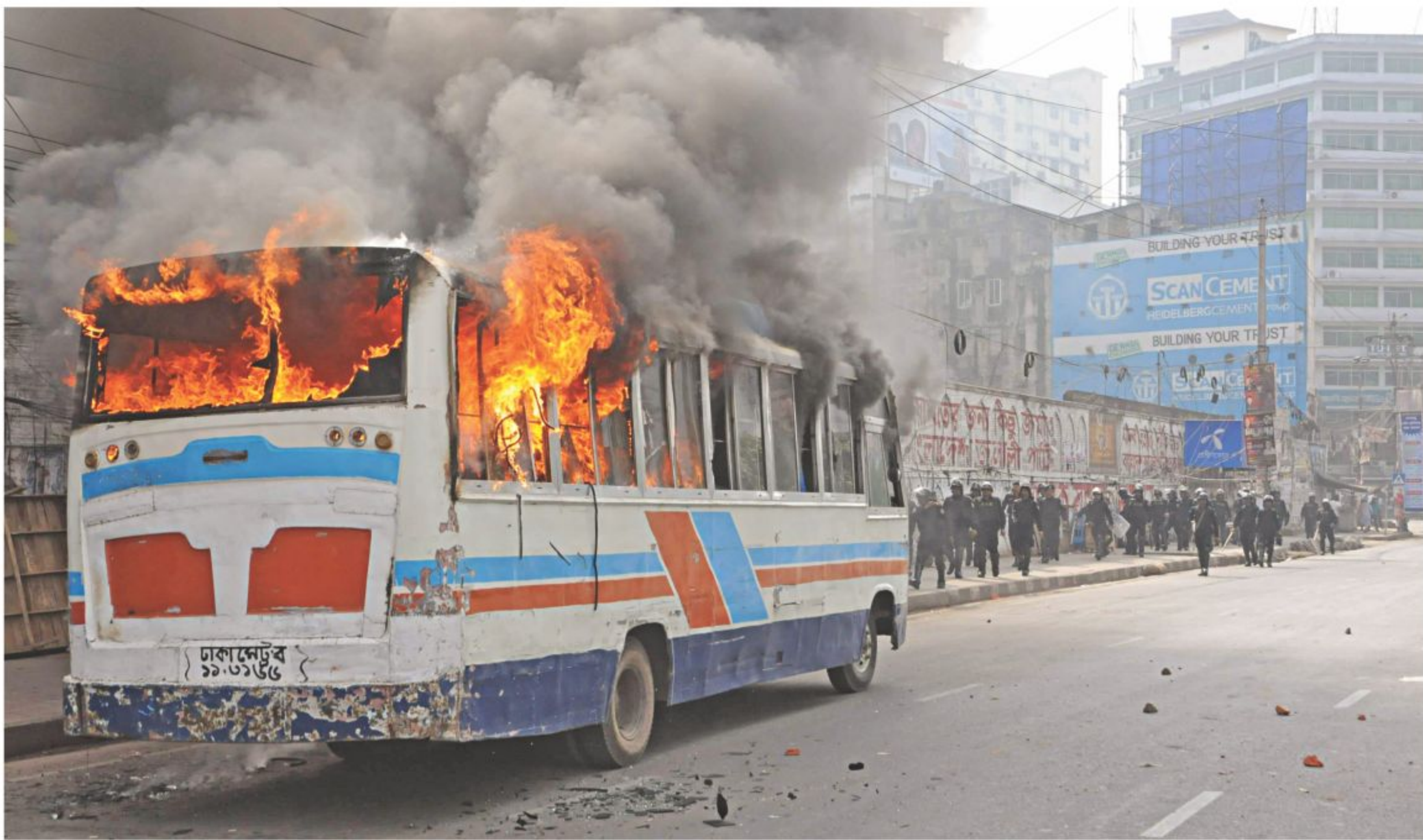
A minibus is set ablaze near Dainik Bangla intersection in the capital yesterday during the clash between Jamaat-Shibir activists and law enforcers.