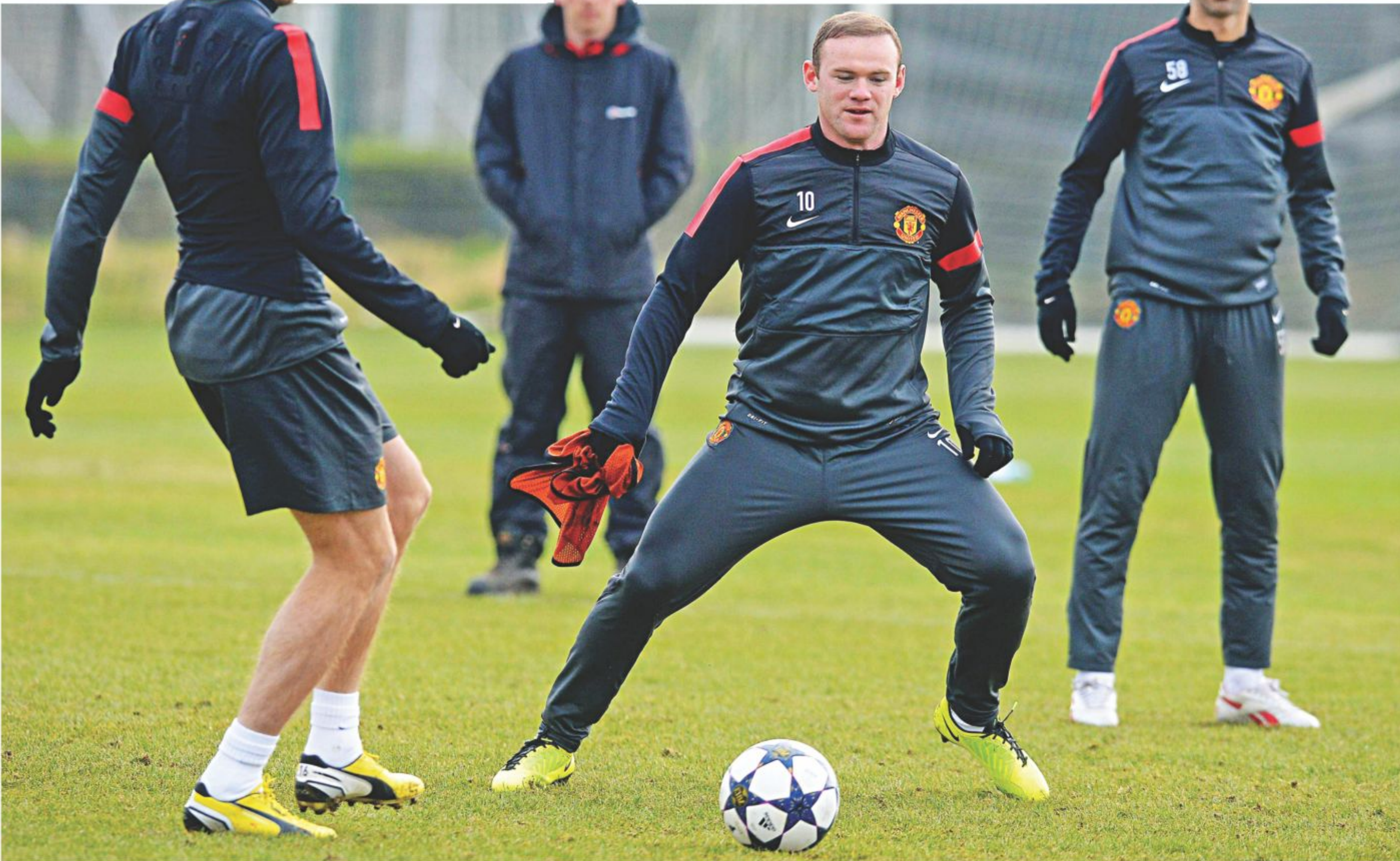
Manchester United star Wayne Rooney (C) takes part in a training session alongside teammates Michael Carrick (L) and Ryan Giggs at Carrington yesterday on the eve of their Champions League clash against Real Madrid.

Alex Ferguson takes his United side to the Spanish capital after extending their lead at the top of the Premier League to 12 points with Sunday's 2-0 win at home to Everton. The meeting also marks the latest instalment in the Ferguson-Mourinho duel with the Scot emerging triumphant last time the pair locked horns as United dispatched Mourinho's former employers Inter Milan 2-0 on aggregate at the same stage of the 2008-09 competition. His current Madrid side is sixteen points behind Barcelona in La Liga and only the delivery of a tenth Champions League title to the famous old club would be enough to appease his critics in the Spanish capital. Mourinho's reign at Madrid has been a tumultuous one this season, with a series of dressing room disputes between the Portuguese coach and his players. Despite the problems Madrid are enjoying some good form, losing only once in twelve outings in all competitions, and it is two years since they lost a Champions League game at the Santiago Bernabeu when Barcelona were the victors. Cristiano Ronaldo will face his old club on the back of another hattrick in the 4-1 win over Sevilla on Saturday and his attacking partner Gonzalo Higuain is convinced their side can beat United in the Bernabeu. Madrid are almost at full strength and the inclusion or not of Portuguese centre-half Pepe is Mourinho's big dilemma.