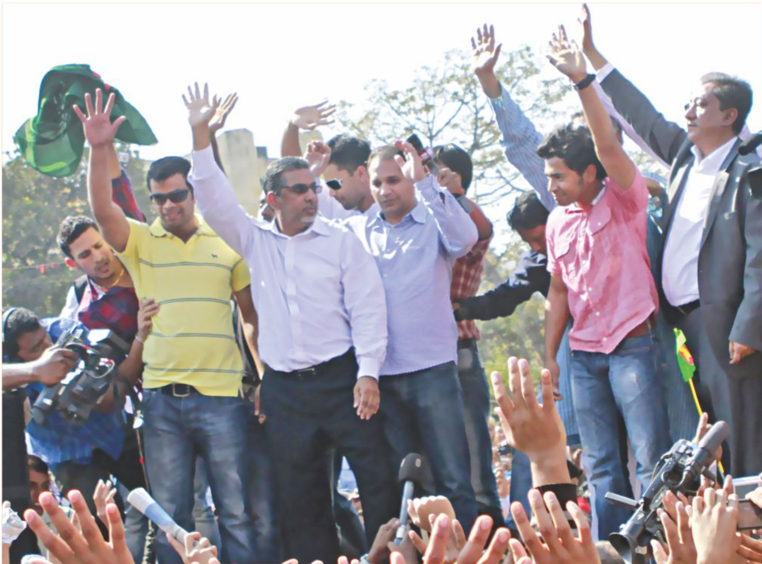
Bangladesh Cricket Board president Nazmul Hassan Papon, right , and national team captain Mushfiqur Rahim, second from right , along with other current and former players and officials of the board render their solidarity with the nonstop mass movement at Shahbagh demanding death penalty for war criminals.