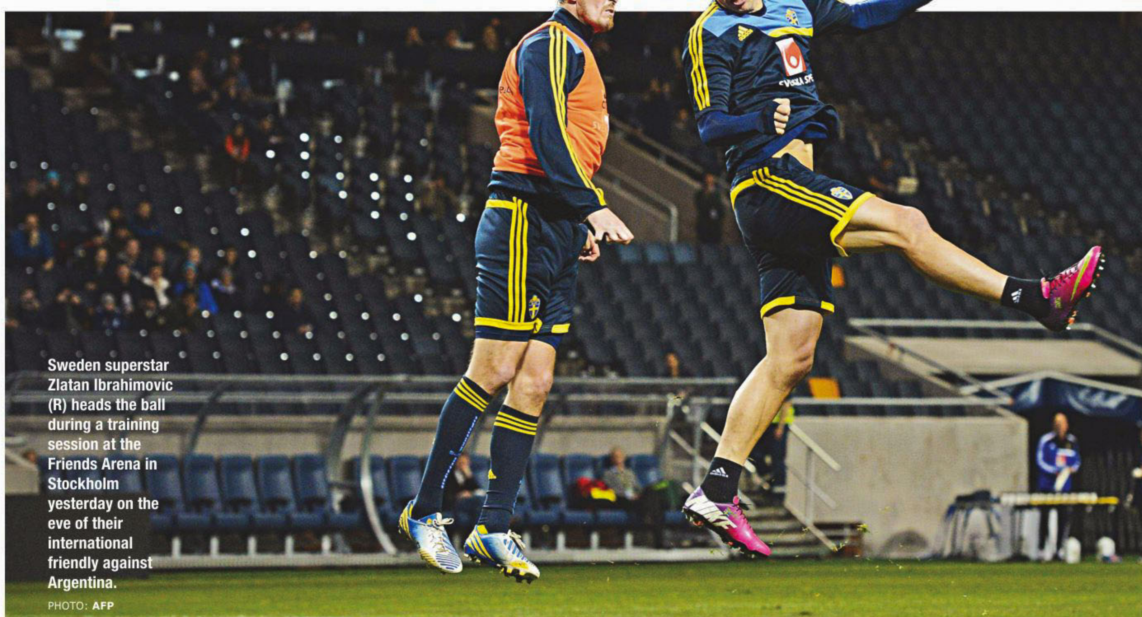
Sweden superstar Zlatan Ibrahimovic (R) heads the ball during a training session at the Friends Arena in Stockholm yesterday on the eve of their international friendly against Argentina.

STAR Sports Australia v West Indies Third ODI Live from 9:20am ESPN Sportscentre India Sports News Live from 8:30pm England v Brazil Int'l Friendly