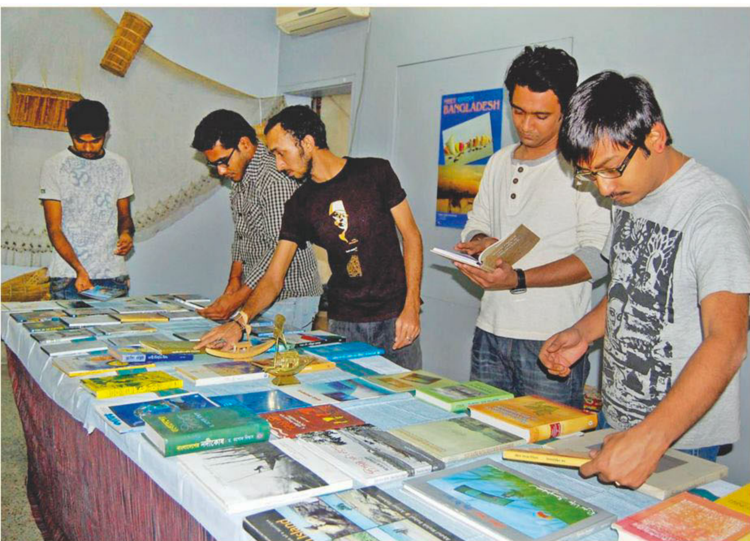
Visitors swarm the book exhibition organised on the third day of the weeklong "Boat Technology and Culture in Chittagong and in Bengal" festival in Bishod Bangla Auditorium in Chittagong city yesterday. The festival is jointly hosted by Alliance Française de Chittagong and The Daily Star.