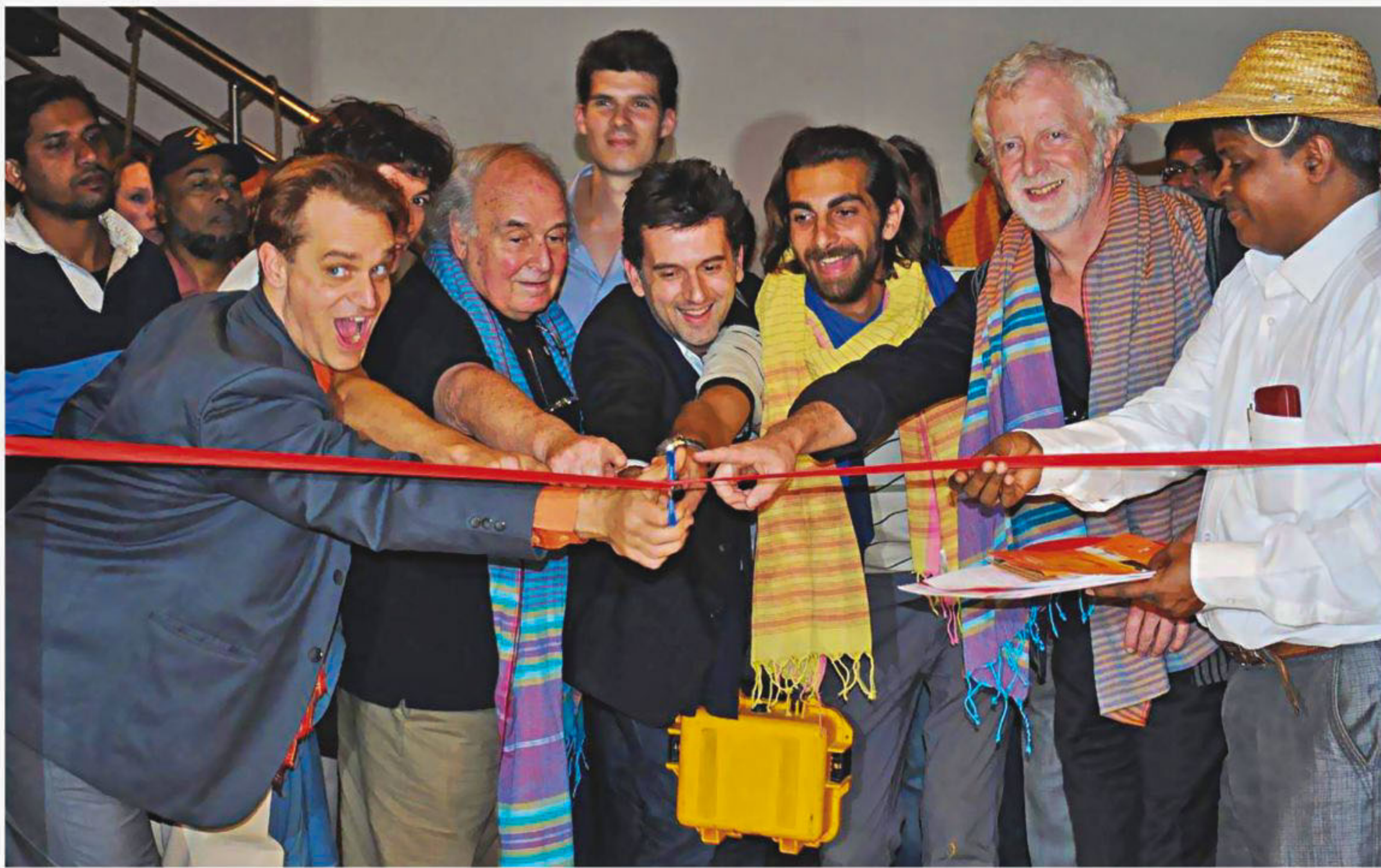
A photo exhibition being inaugurated at Shilpakala Academy in the port city yesterday. The show is part of a weeklong festival featuring Boat Technology & Culture in Chittagong and in Bengal jointly organised by The Daily Star and Alliance Française de Chittagong.