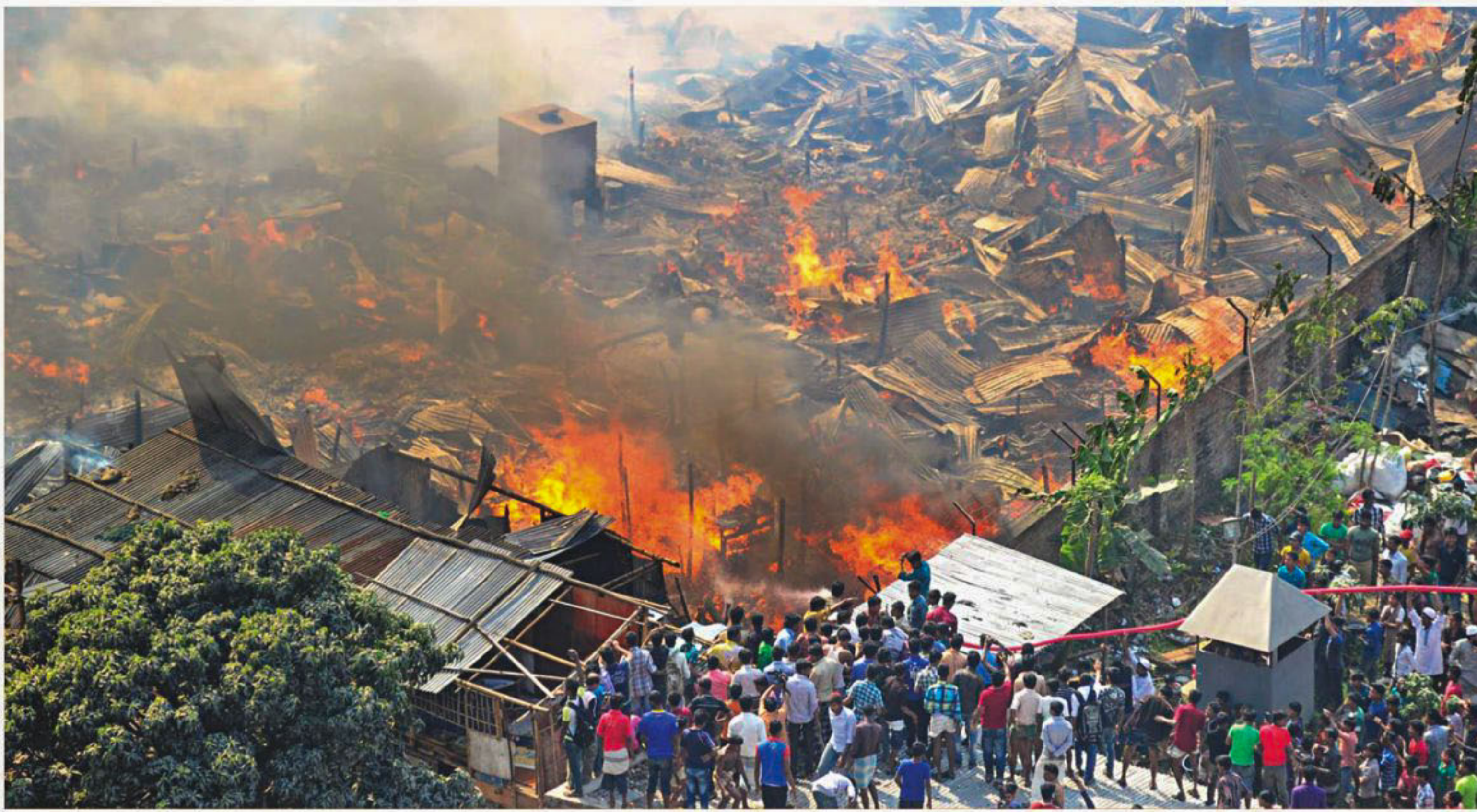
Locals assist fire fighters trying to douse a blaze which burnt down at least 366 shanties at Shahidertek Slum in the capital's Agargaon yesterday. Story on page 3.