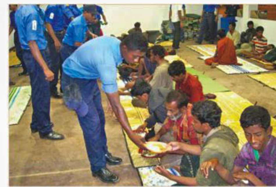
Dazed and exhausted, some of the Bangladeshi and Myanmar nationals rescued on Saturday by the Sri Lankan navy from a sinking boat off Sri Lanka's eastern coast huddle together, above, at Oluvil fishing harbour in the island country. Navy personnel tend to the survivors, giving them water, saline and food.