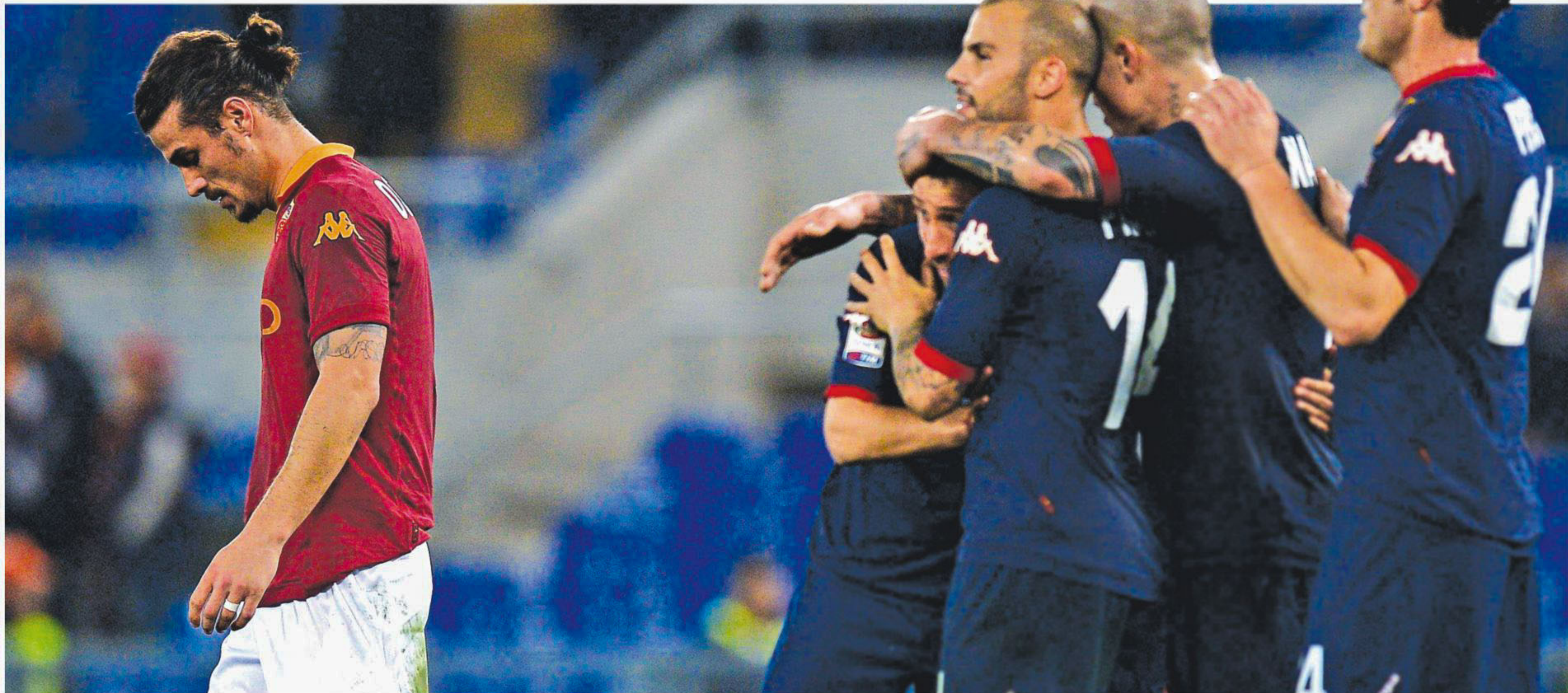
AS Roma forward Pablo Daniel Osvaldo (L) is dejected as Cagliari players celebrate their 4-2 victory at the end of the Serie A match at the Olympic Stadium on Friday.