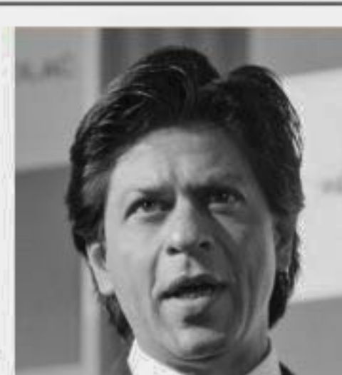
Shah Rukh Khan

AFP, Mumbai Bollywood superstar Shah Rukh Khan has insisted he is "safe and happy" in India in a bid to end a controversy sparked by an article he wrote on being Muslim in the Hindu-majority country. The piece led Pakistan's Interior Minister Rehman Malik to say that India should provide Khan with security. India's Home Secretary RK Singh responded curtly that Pakistan should look after its own citizens. "Nowhere does the article state or imply directly or indirectly that I feel unsafe, troubled or disturbed in India," Khan said in statement. Khan has been targeted by the Shiv Sena, a far-right Hindu nationalist party headquartered in Mumbai that has often pushed an anti-Pakistan and anti-Muslim agenda. "I would like to tell all those who are offering me unsolicited advice that we in India are extremely safe and happy. We have an amazing democratic, free and secular way of life." Khan emerged last week at the top of Forbes India's first Celebrity 100 list, based on income and popularity, after he raked in an estimated 37.7 million dollars last year.