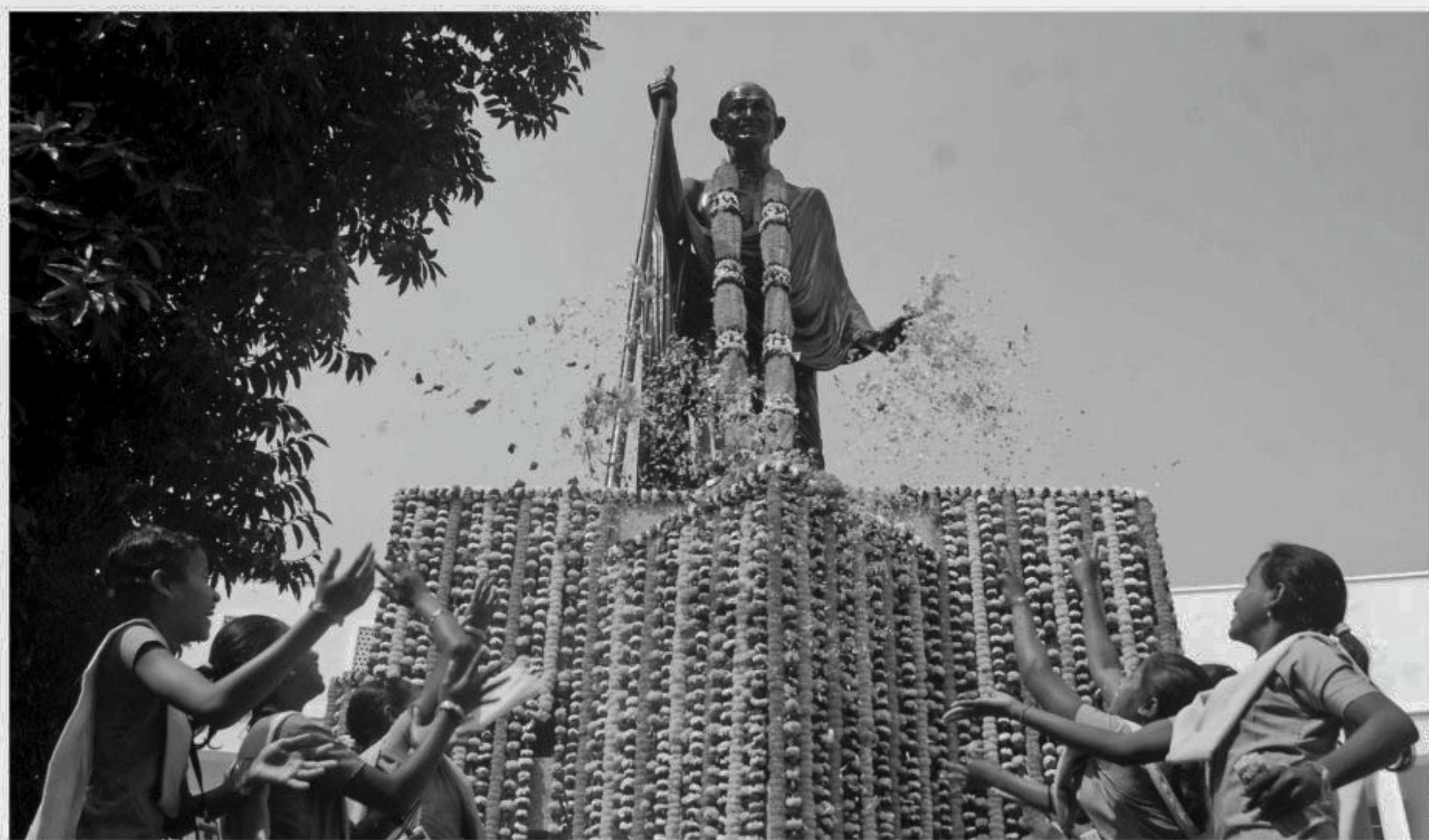
Indian school children pay homage at a memorial statue of Mahatma Gandhi on his 65th death anniversary in Bhubaneswar yesterday. Gandhi was shot by a Hindu hardliner on January 30, 1948 at a prayer meeting in New Delhi. India observes Gandhi's death anniversary as Martyrs Day in the memory of its freedom fighters.

The report follows a series of killings of soldiers on both sides earlier this month along the de facto border known as the Line of Control (LoC). Pakistan says three of its soldiers were killed in firing by Indian troops while India accuses Pakistani troops of killing two of its soldiers on January 8, one of whom was beheaded. Pakistan has denied responsibility. The situation along the LoC has calmed since the two armies agreed a ceasefire on January 16. In its complaint before the UNMOGIP, Pakistan is reported to have accused India of beheading 12 soldiers and killing 29 civilians since 1998. The newspaper quoted an unnamed senior Pakistani army officer stating that they have "sought to downplay these incidents... Each of these incidents has been protested by us on both military and UNMOGIP channels".