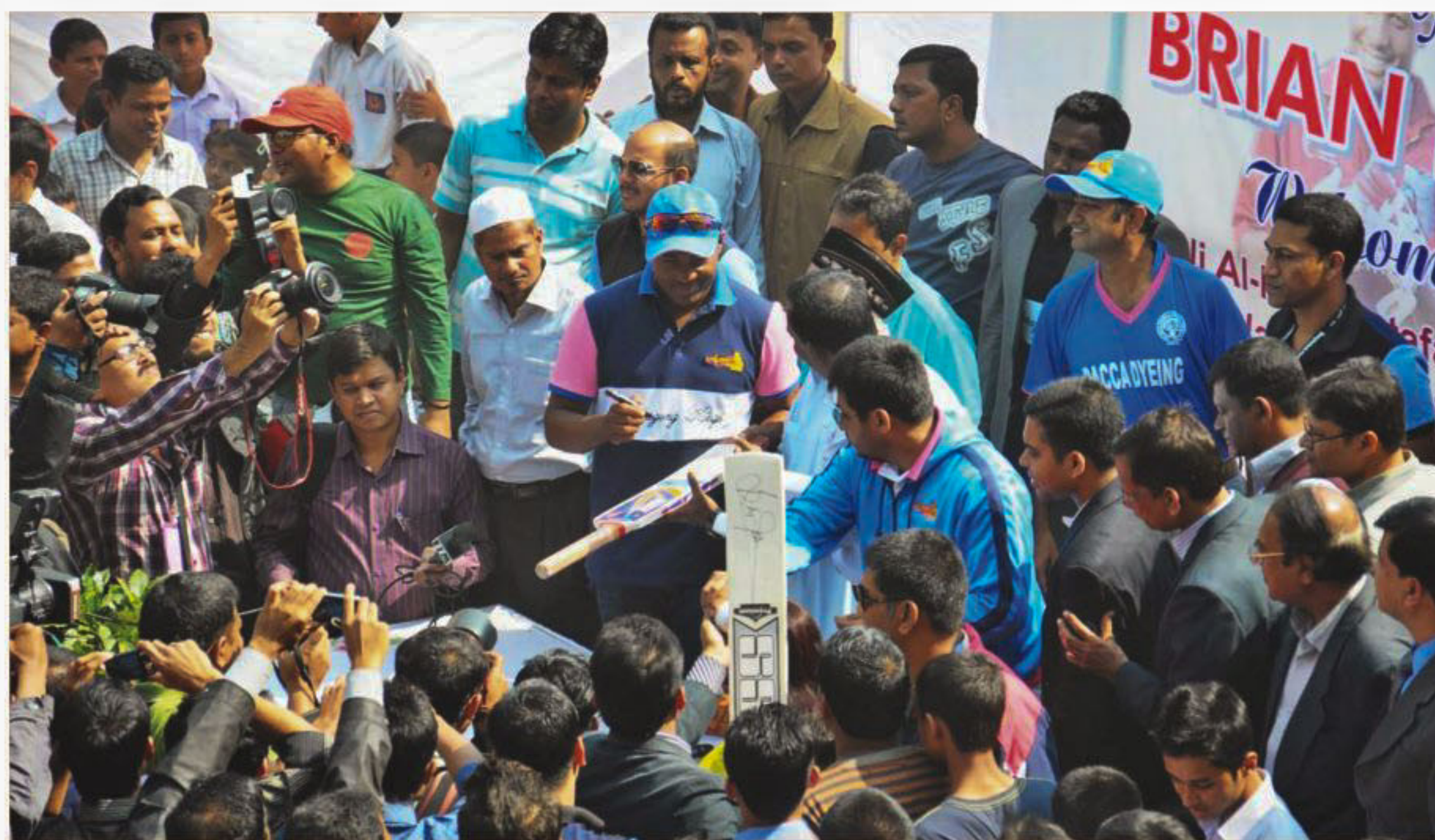
Chittagong Kings' brand ambassador Brian Lara complies with the demand of fans by signing autographs during his visit to the Mostafa Hakim High School and College at Katuli in the port city yesterday.