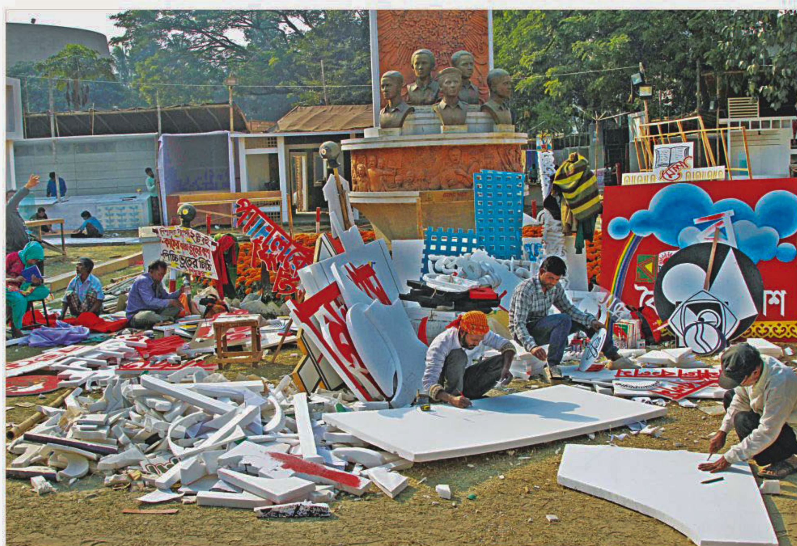
Last-minute preparations under way on Bangla Academy premises with the month-long Amar Ekushey Boi Mela just a day away.

Two cases were filed the next day with Karnaphuli Police Station in this connection and the trial began on November 29, 2011.