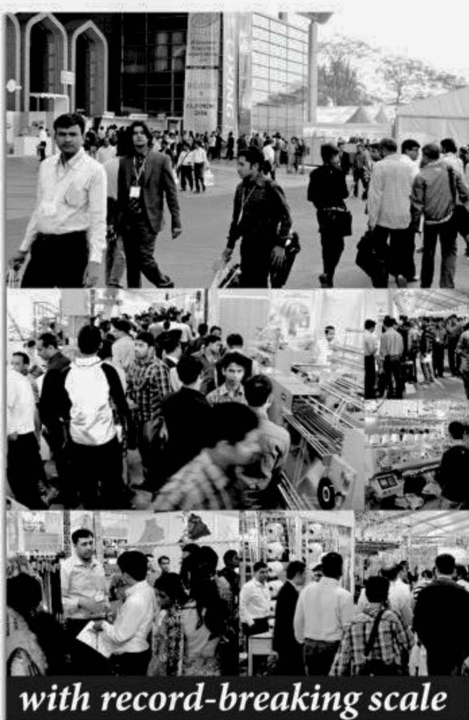
with record-breaking scale

Special Gifts EVERYDAY for the first 1000 visitors