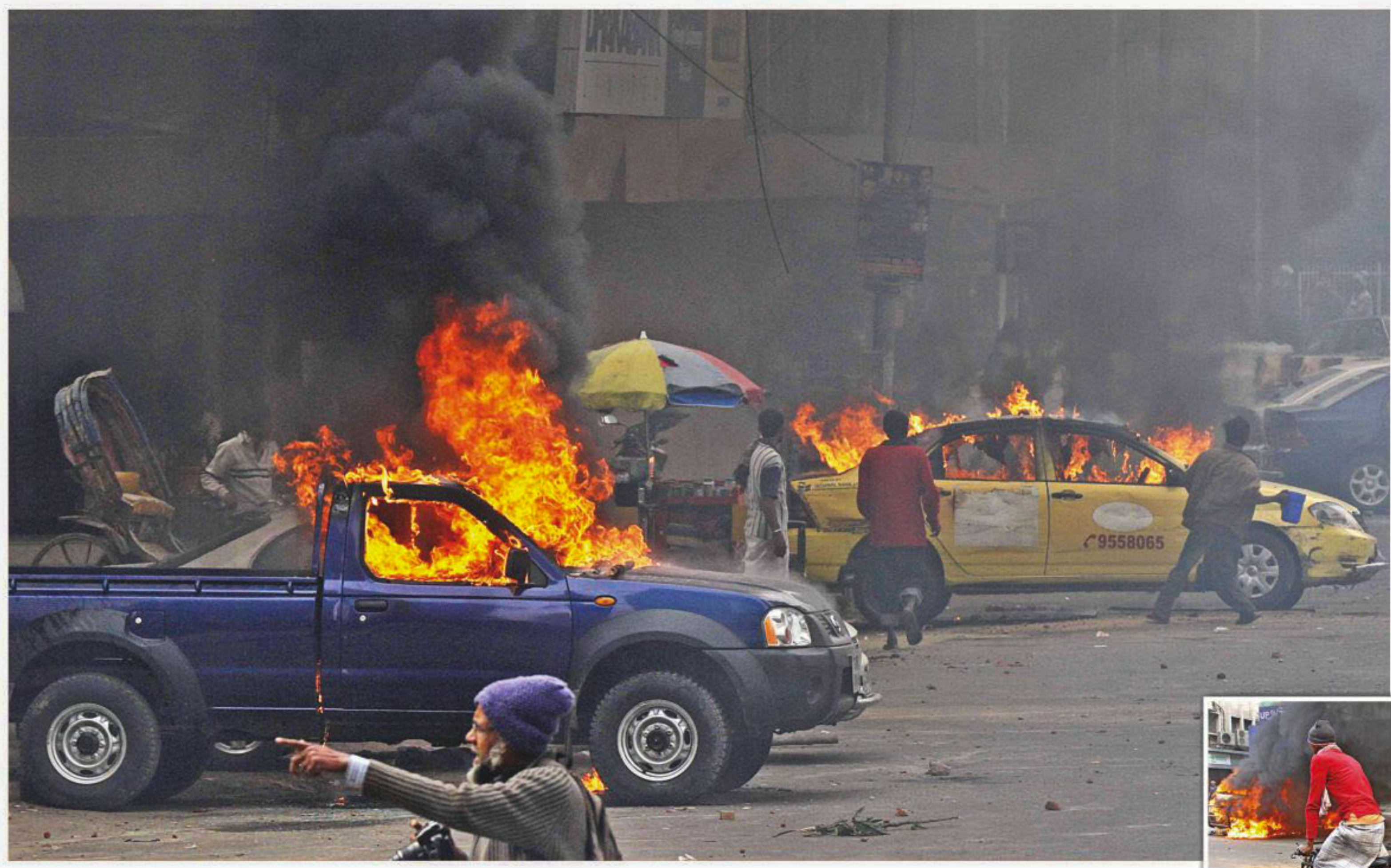
Vehicles set alight by Jamaat-Shibir men during a clash with law enforcers in the capital's Motijheel area yesterday morning. Inset, police take their colleague injured by the rioting activists.

STAFF CORRESPONDENT Jamaat-e-Islami and its student wing Islami Chhatra Shibir yesterday unleashed terror on police in the capital and elsewhere to mount pressure on the government to stop the war crimes trials. Once again, their hit-and-run assaults caught the law enforcers off guard in Dhaka, Chittagong, Rajshahi, Dinajpur, Joypurhat and Satkhira. The Jamaat-Shibir mayhem left at least 70 people, including 50 cops, injured. A policeman and an auto-rickshaw driver in Chittagong suffered bullet wounds as Shibir activists opened fire. They smashed around 200 vehicles across the country. Neither Jamaat nor its student wing had called a programme for yesterday. But around 10:00am yesterday, the Jamaat-Shibir men brought out militant processions simultaneously in Dhaka, Chittagong and Rajshahi cities, welding firearms, SEE PAGE 19 COL 2 MORE ON PAGE 3