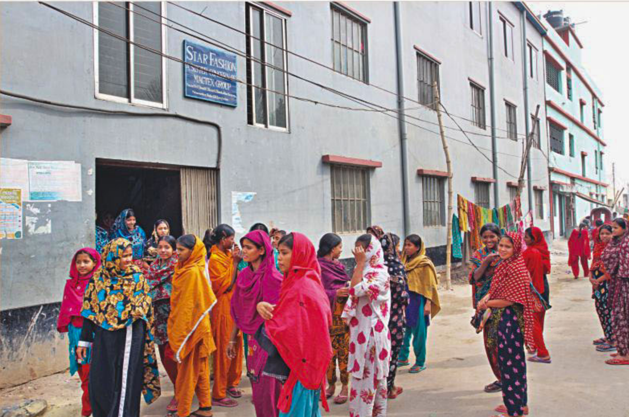
The building that unlawfully houses an industrial unit in the capital's Mohammadpur area is a residential one. Top right, an operator stitches a garment at the factory with piles of fabric seen illegally stored overhead. Bottom right, fabrics and other materials are seen stuffed partly blocking the exit. The photos were taken yesterday.