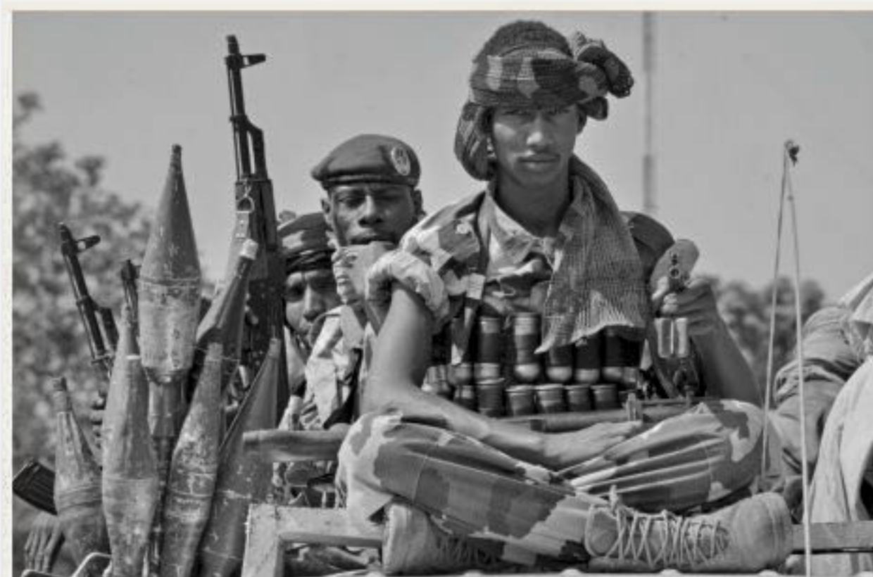
A Chadian army convoy heading to join Mali force.

"We are winning very rapidly," Manga Dembélé, Mali's communications minister, told the Guardian on Friday. "We are making quick progress ... The rebels have been