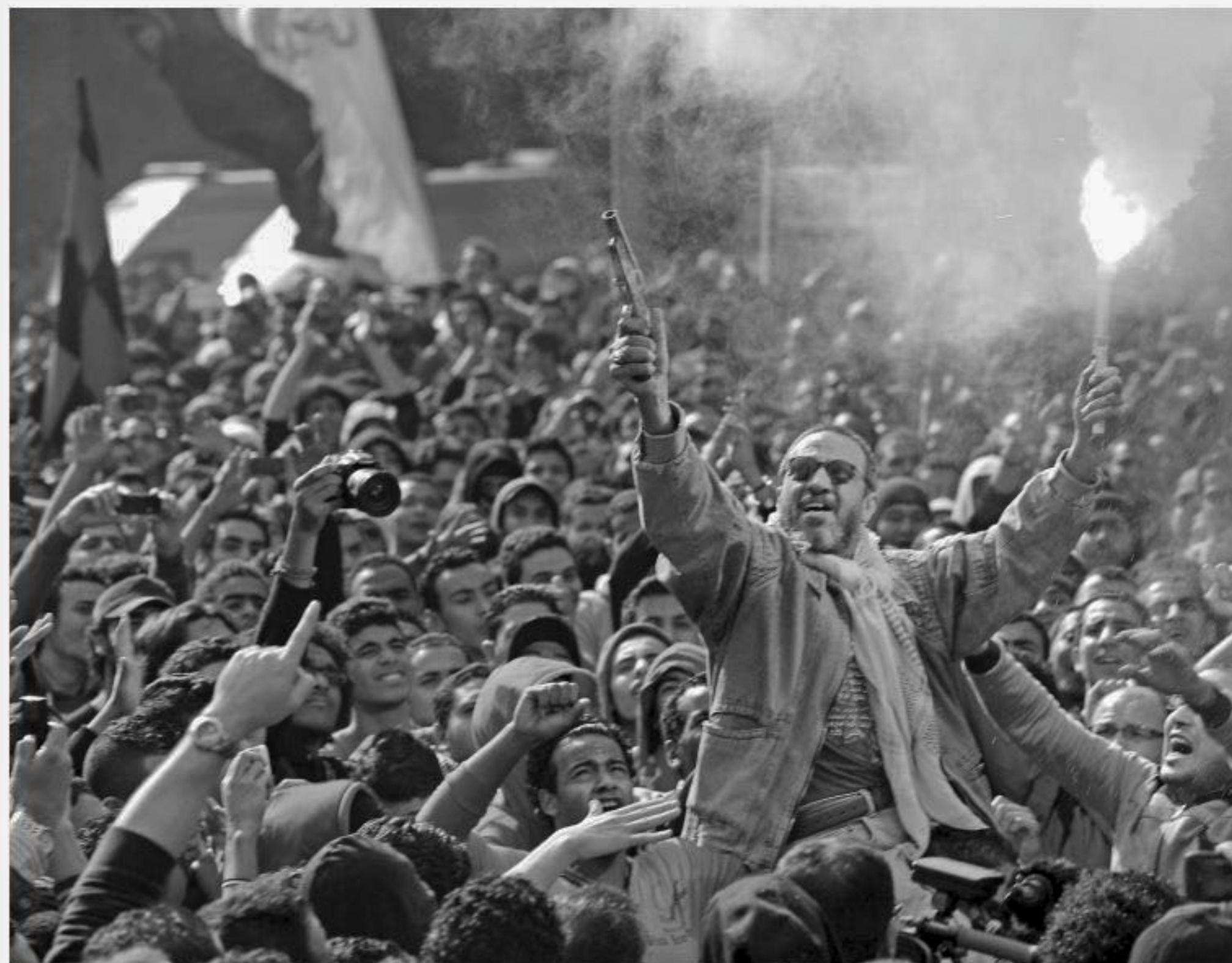
An Egyptian fan of Al-Ahly football club fires celebratory shots in the air and lights a flare as club supporters celebrate outside its headquarters in Cairo yesterday. Top right, Al-Ahly football club fans celebrate outside the club's headquarters in Cairo as relatives of the convicted man react to the court order, bottom right. (Story on Page 20)

The UN Security Council unanimously condemned North Korea's December rocket launch on Tuesday and expanded existing UN sanctions.