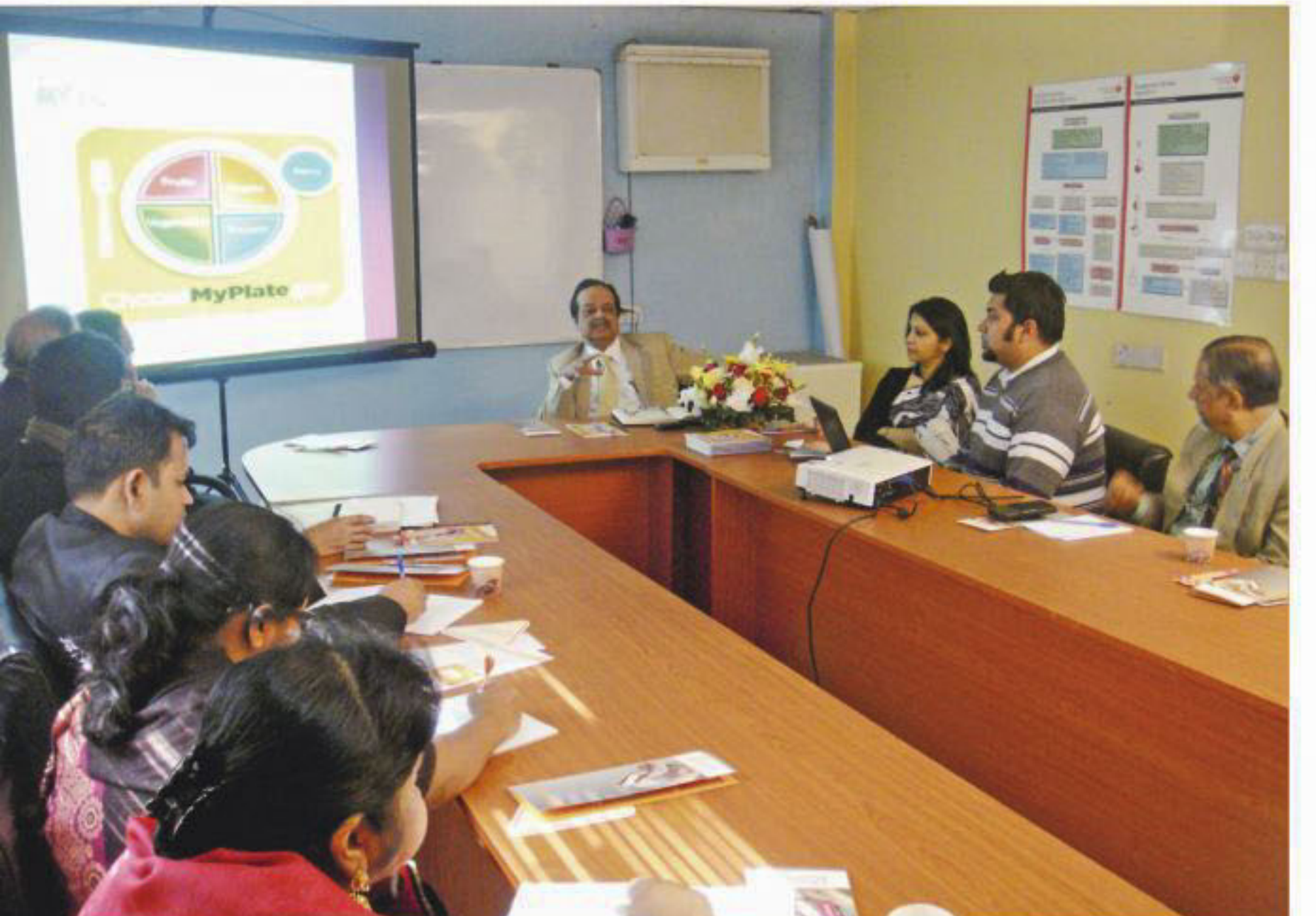
Participants at a health lecture session on "Healthy Lifestyle" at Ahmad Medical Centre in the capital yesterday. Health Prior 21, a health care solution portal and health care management centre, organised the lecture.