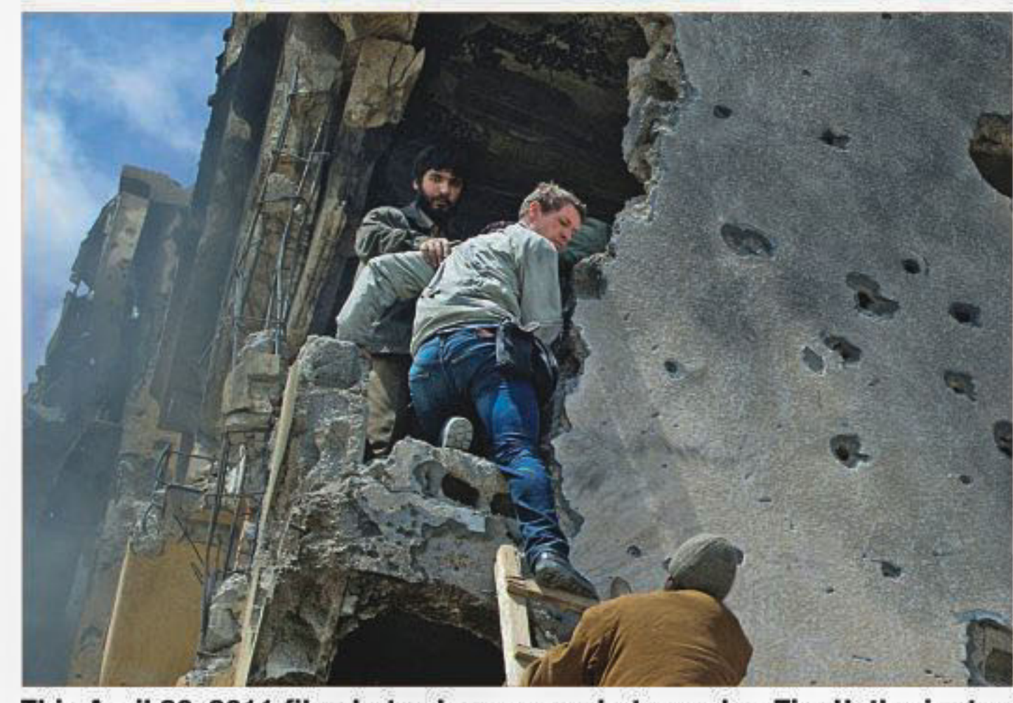
This April 20, 2011 file photo shows war photographer Tim Hetherington being assisted by Libyan rebels in Misrata hours before he was killed.