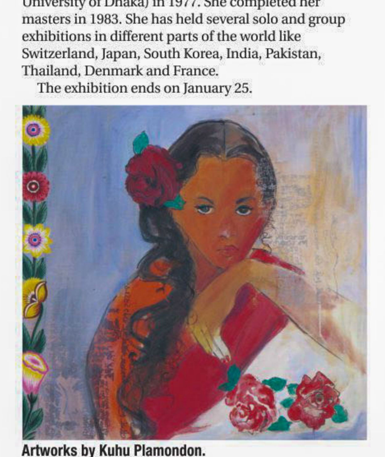
Artworks by Kuhu Plamondon.