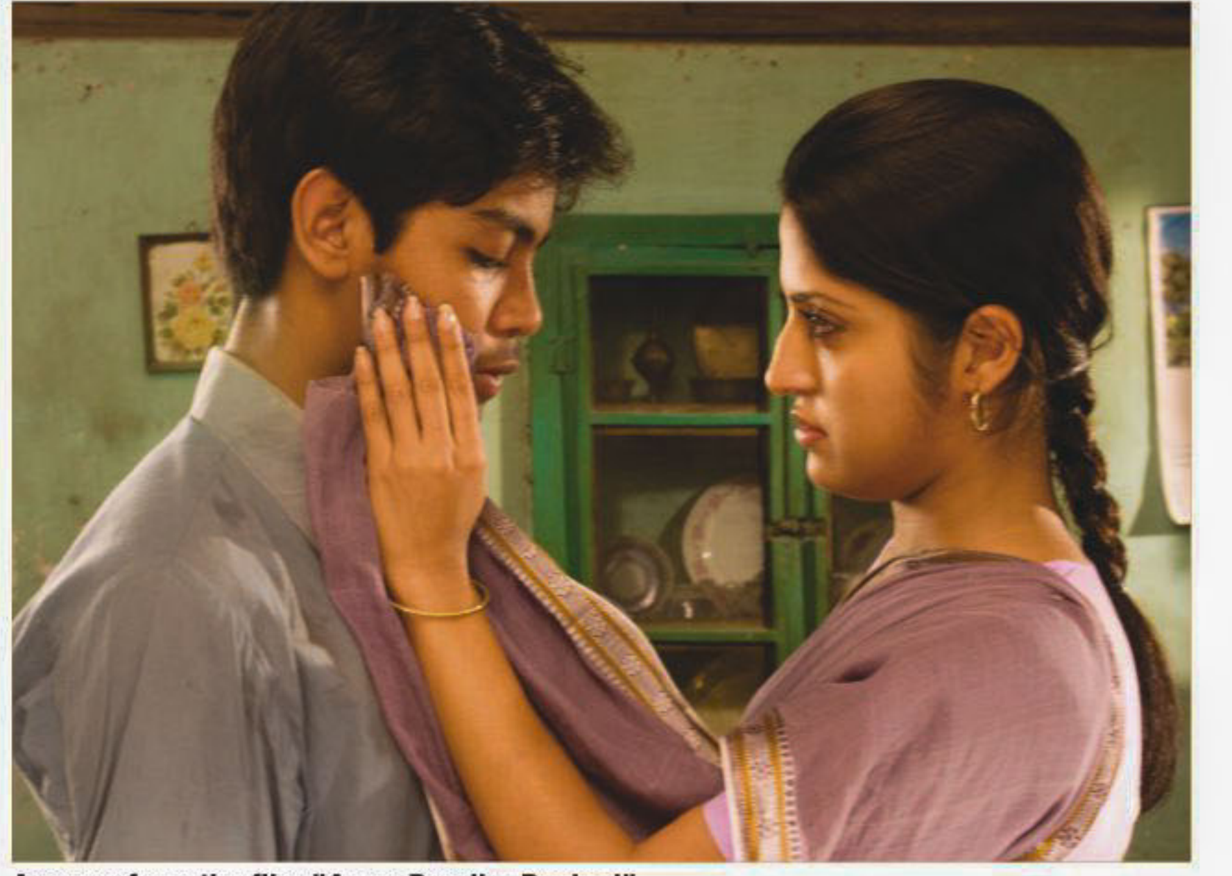
A scene from the film "Amar Bondhu Rashed".