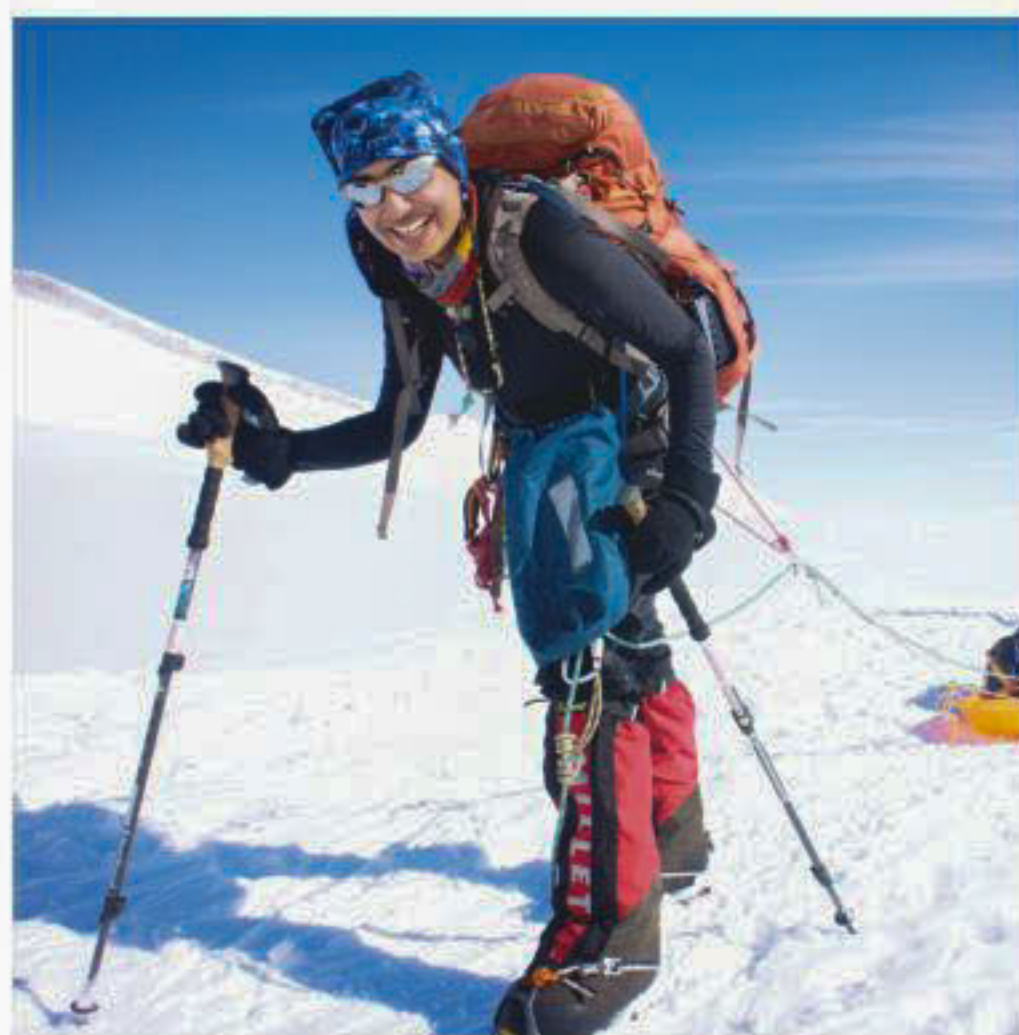
Wasfia Nazreen conquering another peak; this time it was Mount Vinson -- the highest point of Antarctica -- on January 4, 2013.

Following a flag-off ceremony early in November last year, Wasfia had set off for an