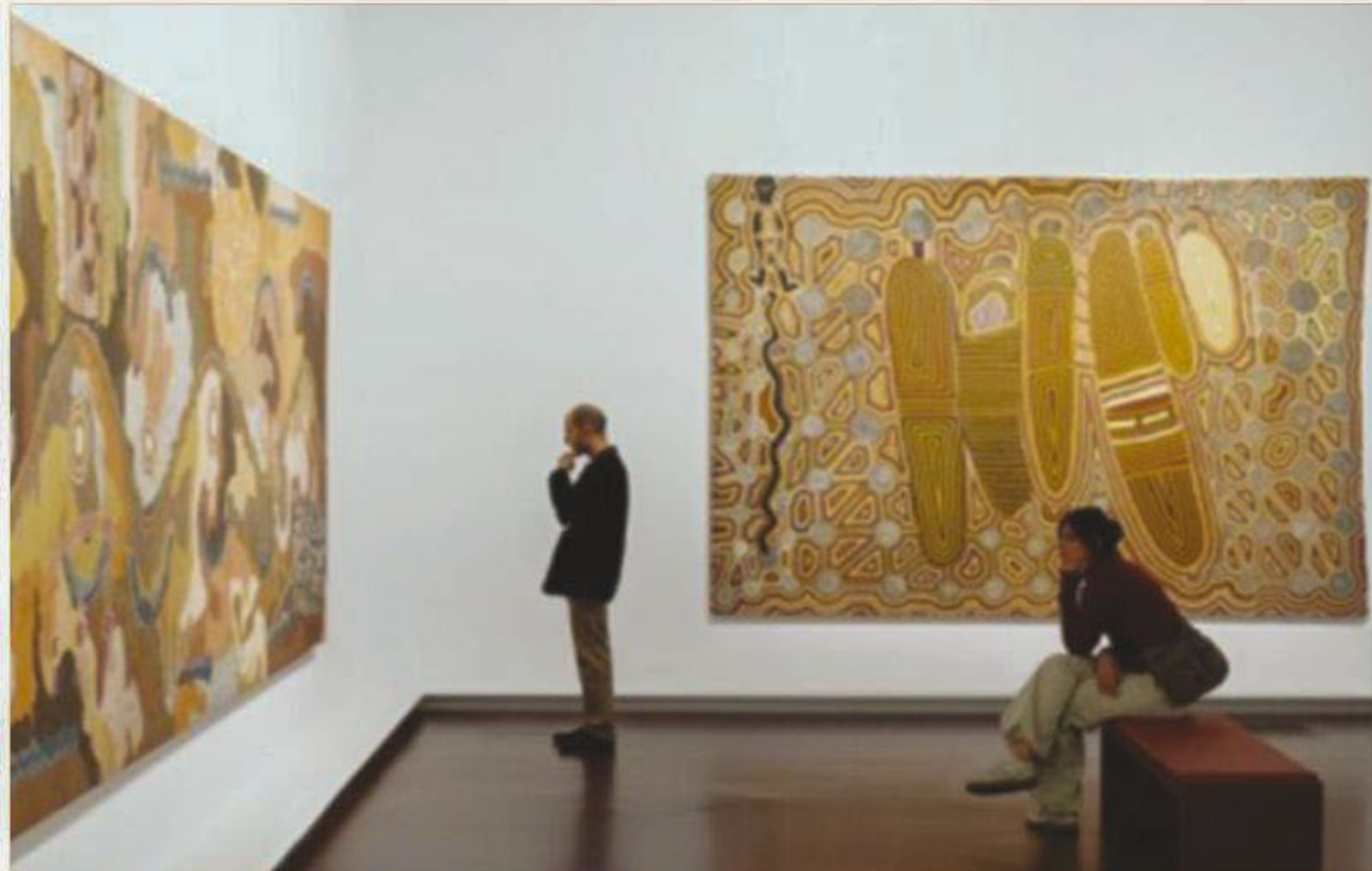
A man looks at the painting by Aboriginal artist Clifford Possum Tjapaltjarri at the Quai Branly Museum in Paris.