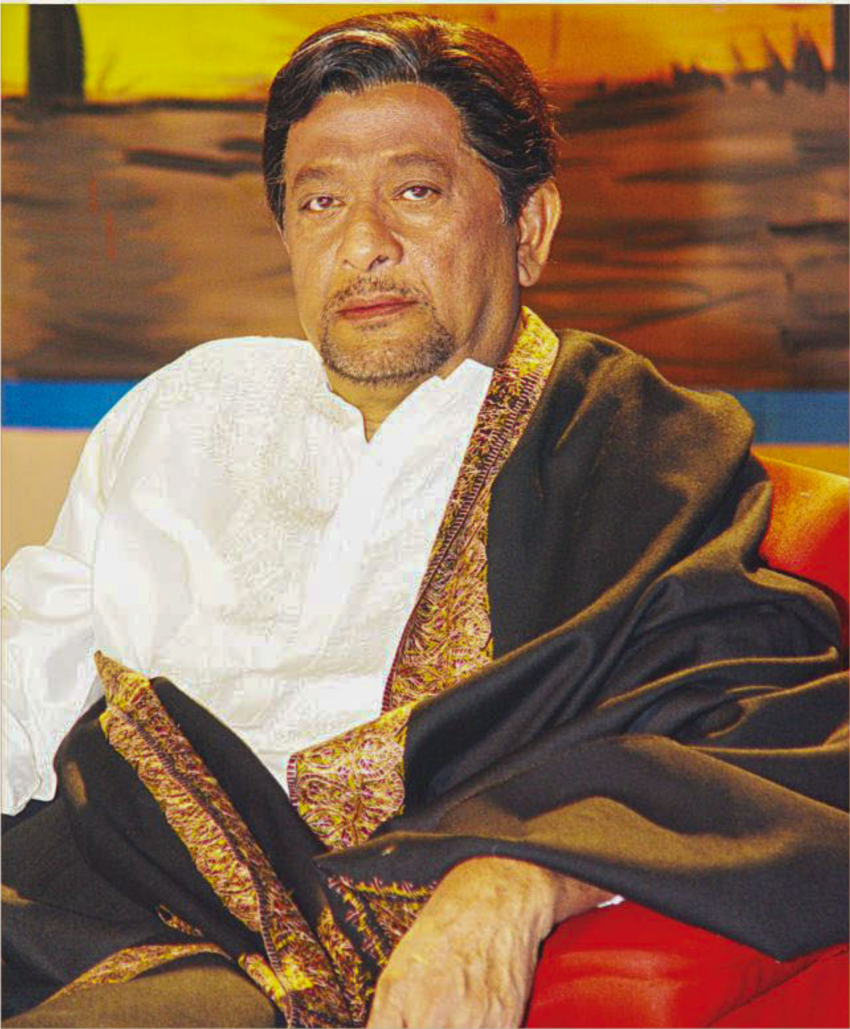
Razzak celebrates his 71st birthday today.

Razzak made his directorial debut in 1977 with the film "Ononto Prem". He played the role of the protagonist, while Bobita played the female lead. The movie featured the evergreen song "O Chokhe Chokh Porekhe Jokhoni". Razzak also directed an adaptation of "Chapadanga