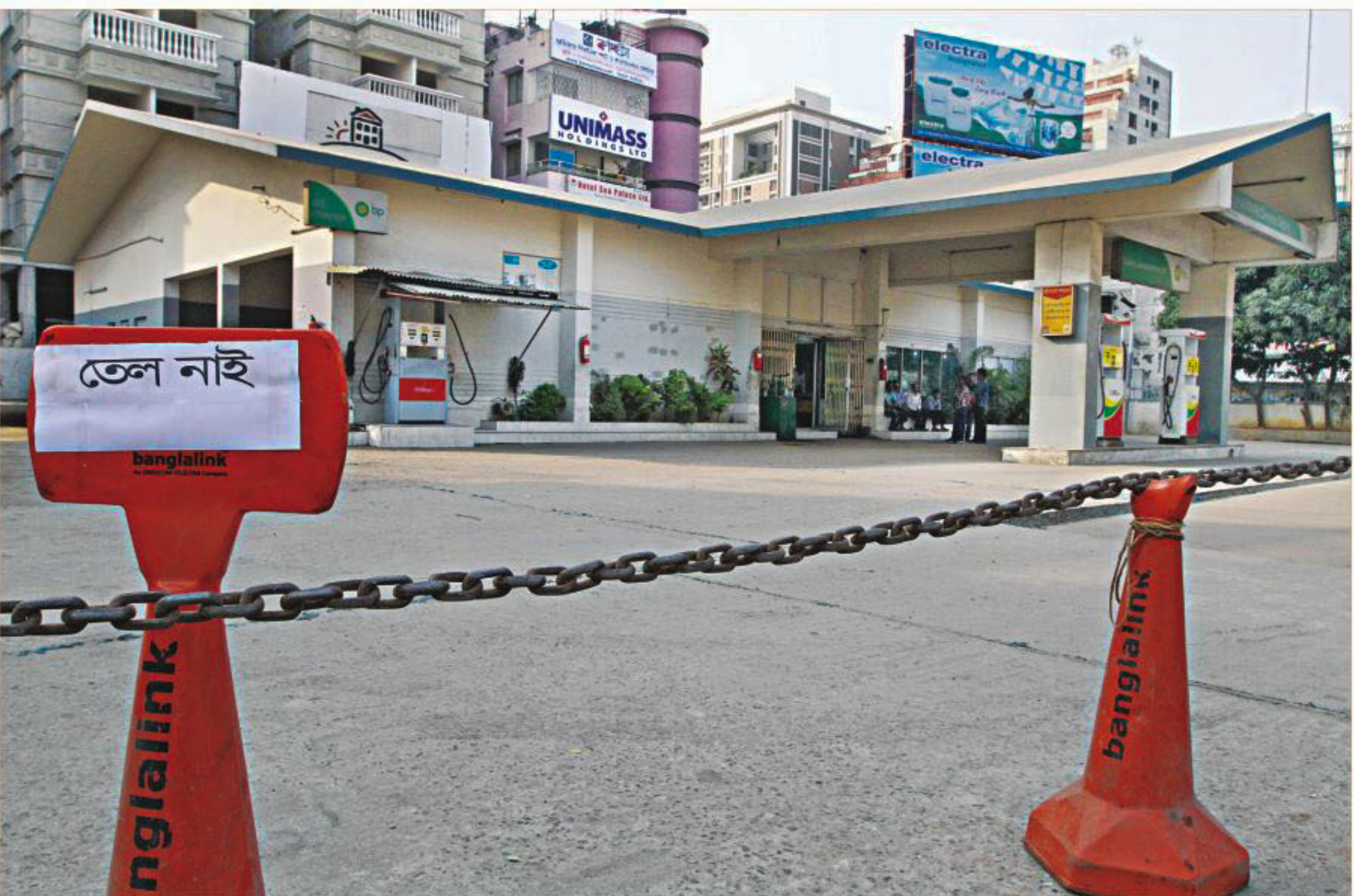
STAR Petrol pump owners went on strike countrywide to press home their nine-point demands, much to consumers' sufferings. The strike was called off yesterday after the government met the demands.