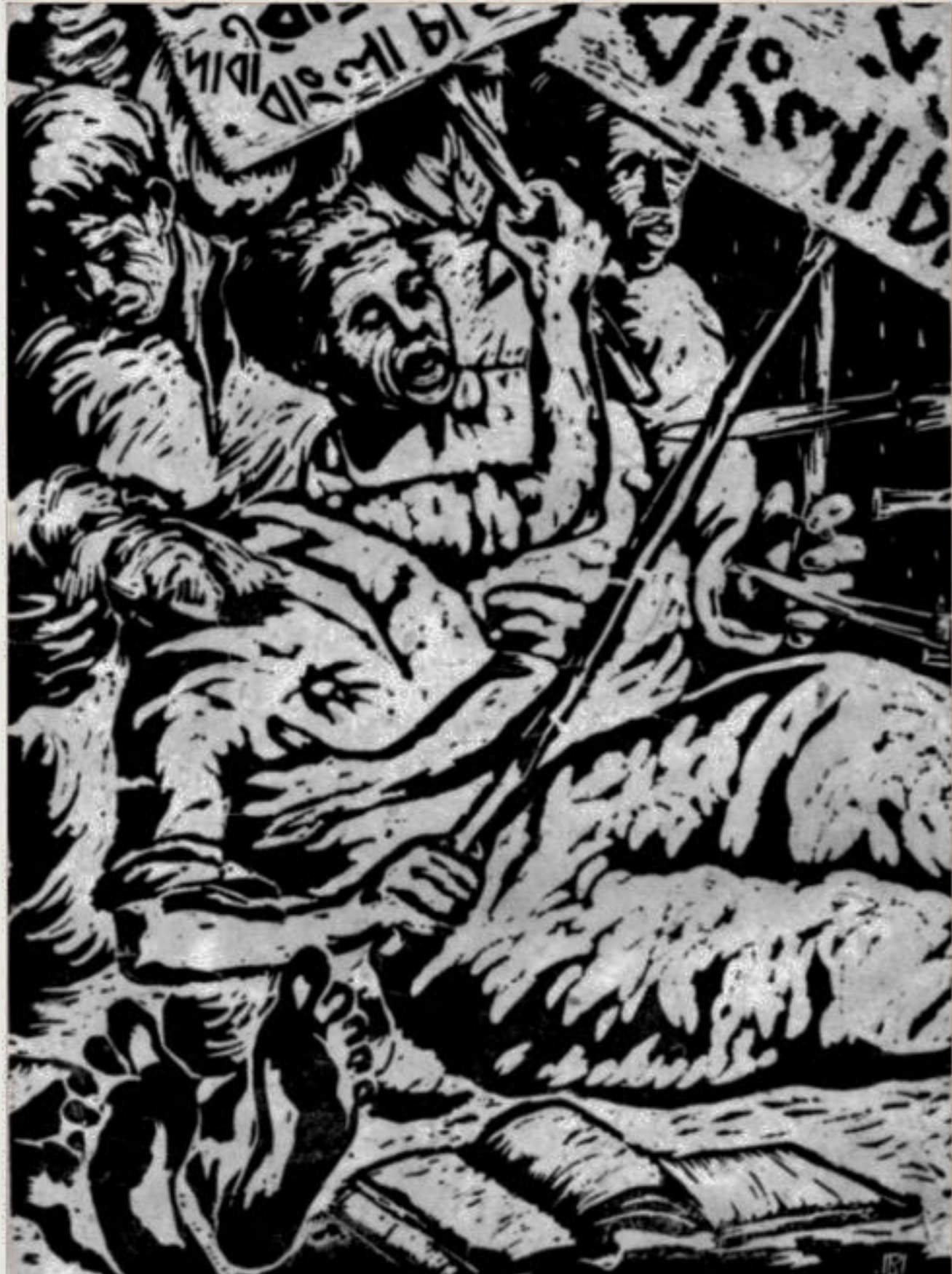
A linocut by Murtaja Baseer.