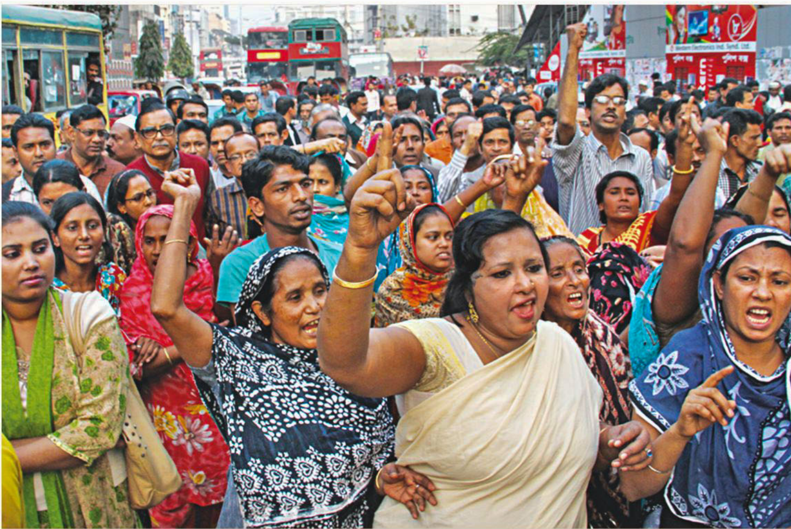
Locals demonstrate in front of Jatiya Press Club in the capital yesterday with the body of a 10-year-old girl, not in picture , demanding exemplary punishment to persons who raped and murdered the girl in a building in Topekhana on January 14.