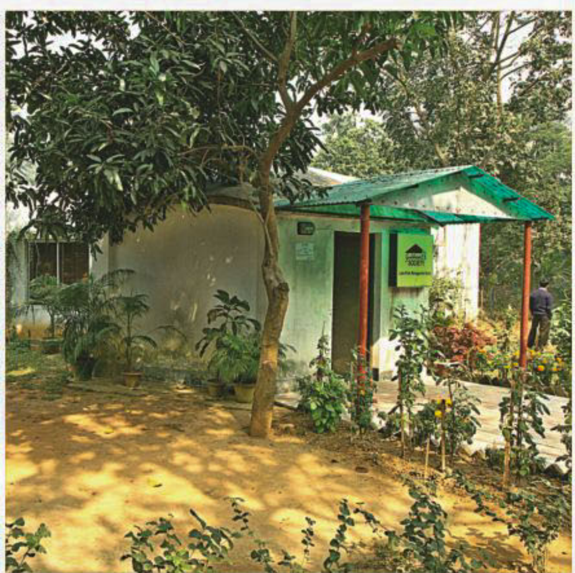
A bungalow of Gulshan Society.