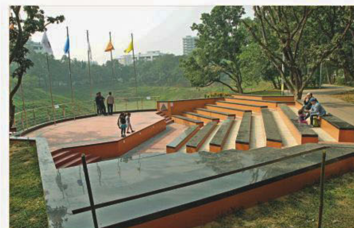
The amphitheatre built by Gulshan Society.