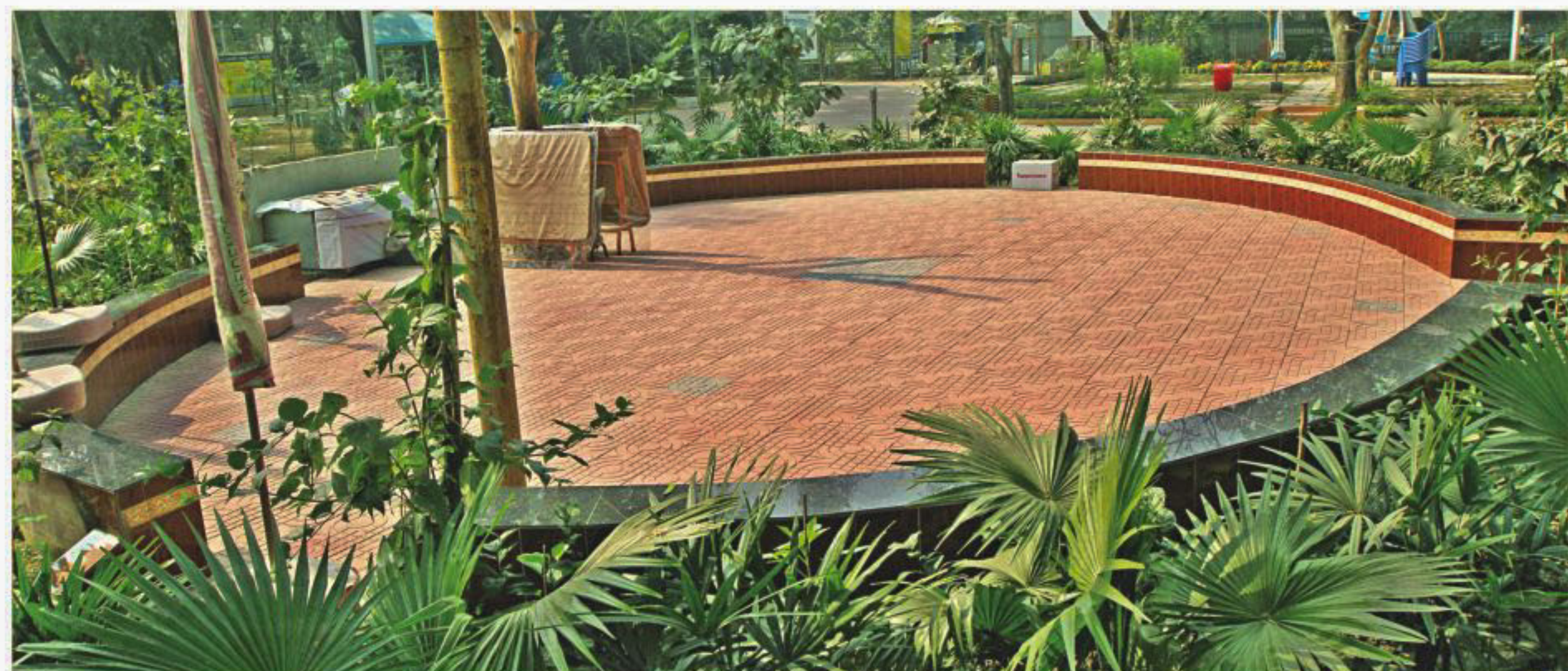
A structure built by Walkers' Club.