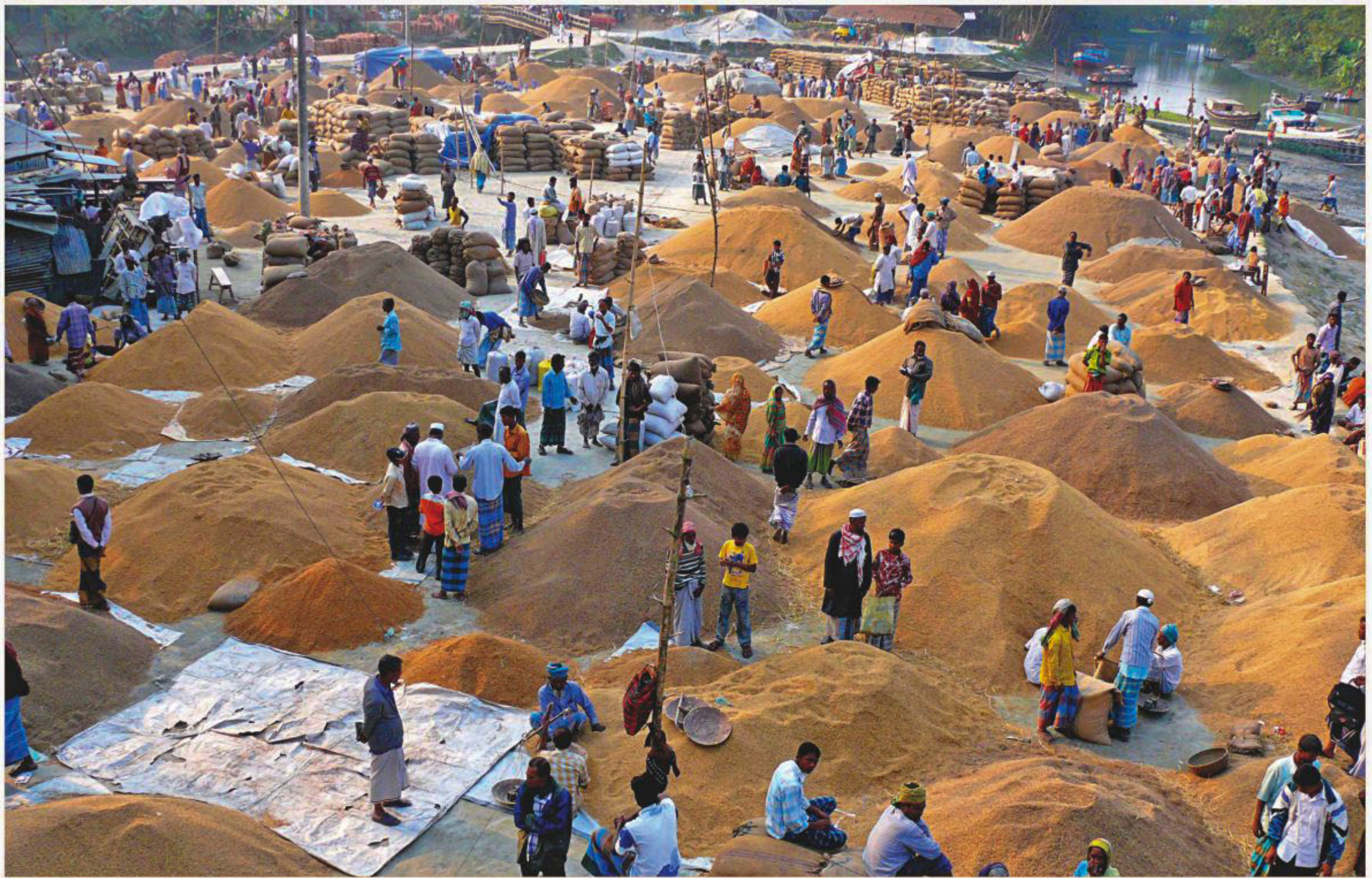
Trading continues at a wholesale paddy market of Bauphal upazila in Patuakhali. Farmers who came to the market returned frustrated as the prices were much lower than what they had expected. The photo was taken a few days ago.