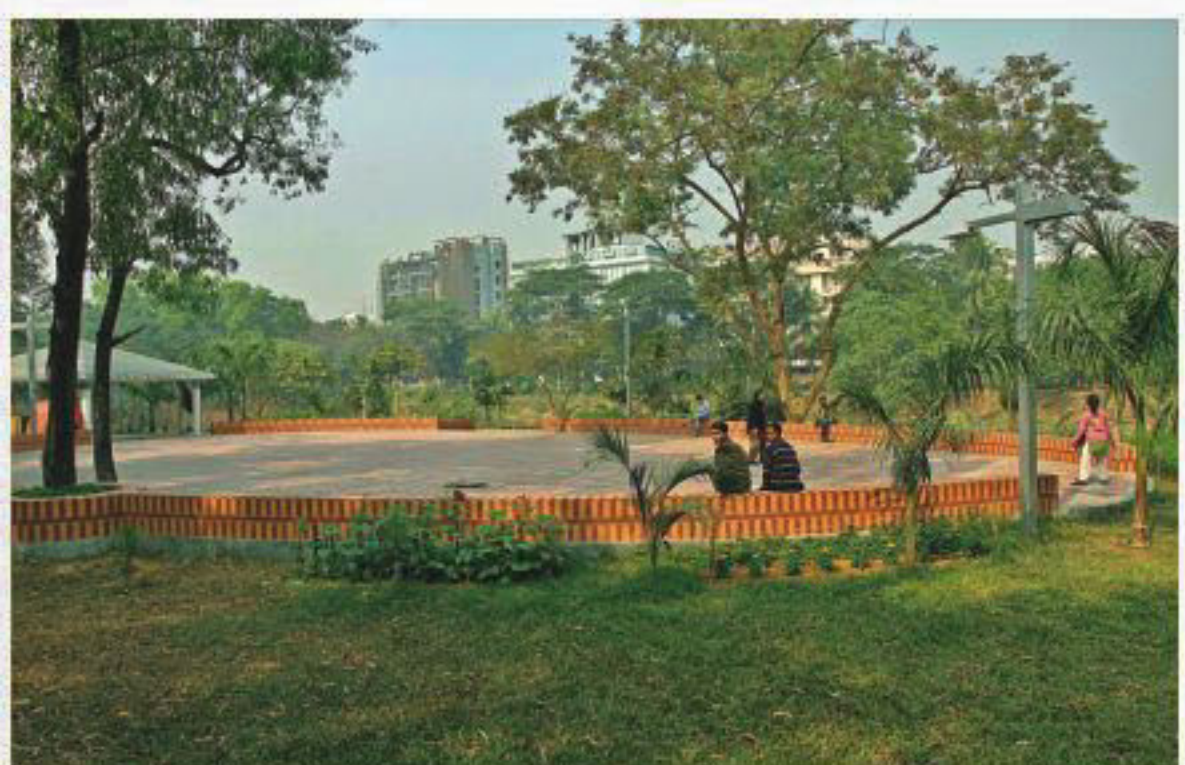
A concrete structure built by Joggers' Society.