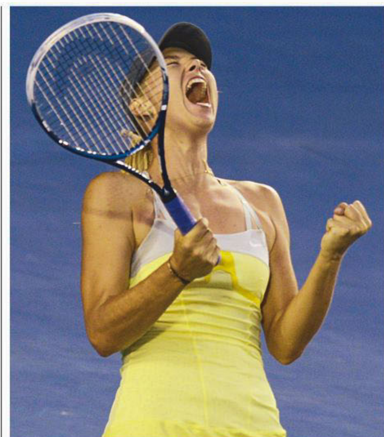
Russian glamour girl Maria Sharapova lets out a loud shriek after annihilating America's Venus Williams 6-1, 6-3 in the third round of the Australian Open in Melbourne yesterday.