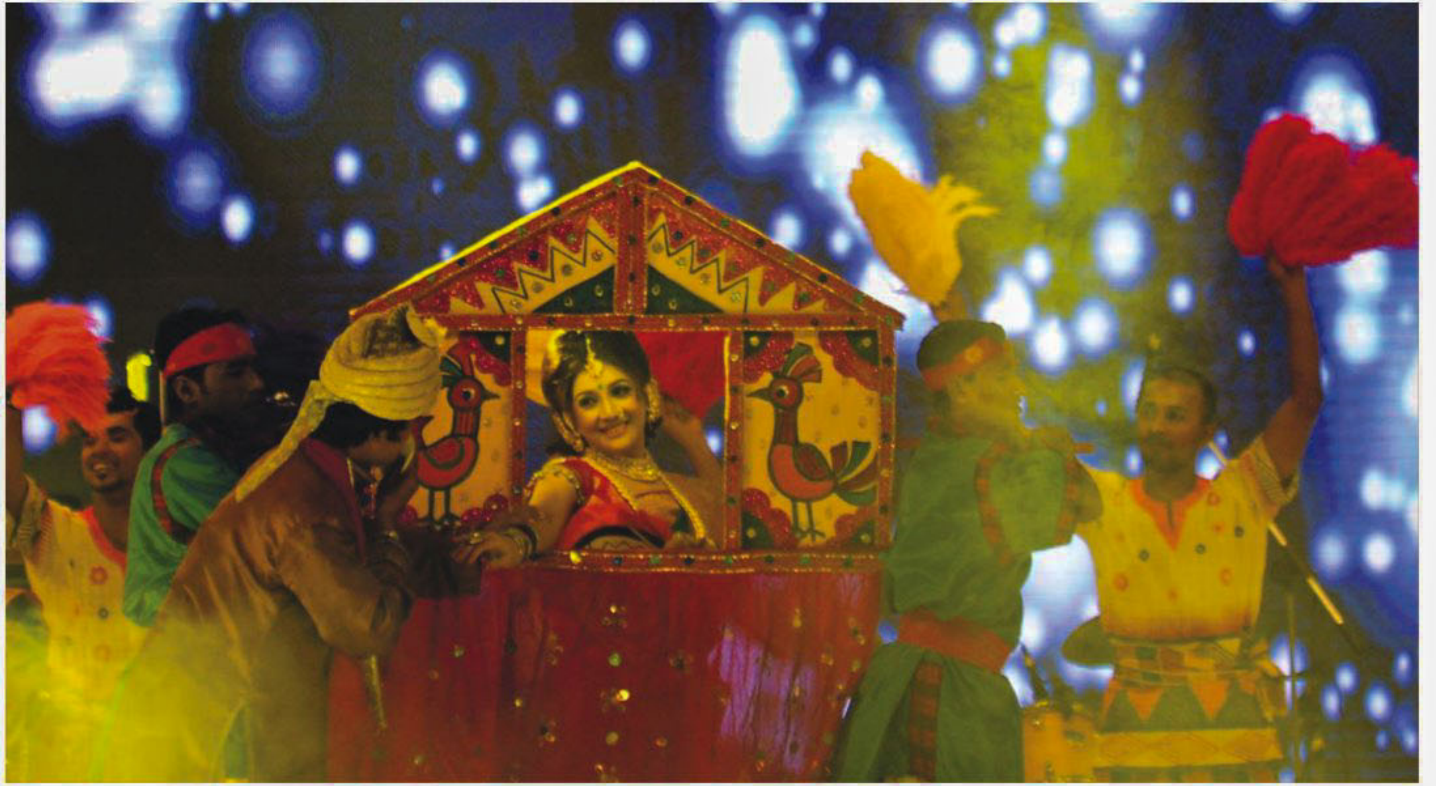
A performer, acting as a bride, takes a palanquin ride during the colourful opening ceremony of the second Bangladesh Premier league at the Sher-e-Bangla National Stadium in Mirpur yesterday.