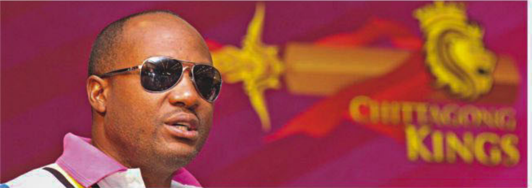
Brian Lara, the prince of Trinidad and now a brand ambassador of Chittagong Kings, speaks to reporters at a city hotel yesterday.