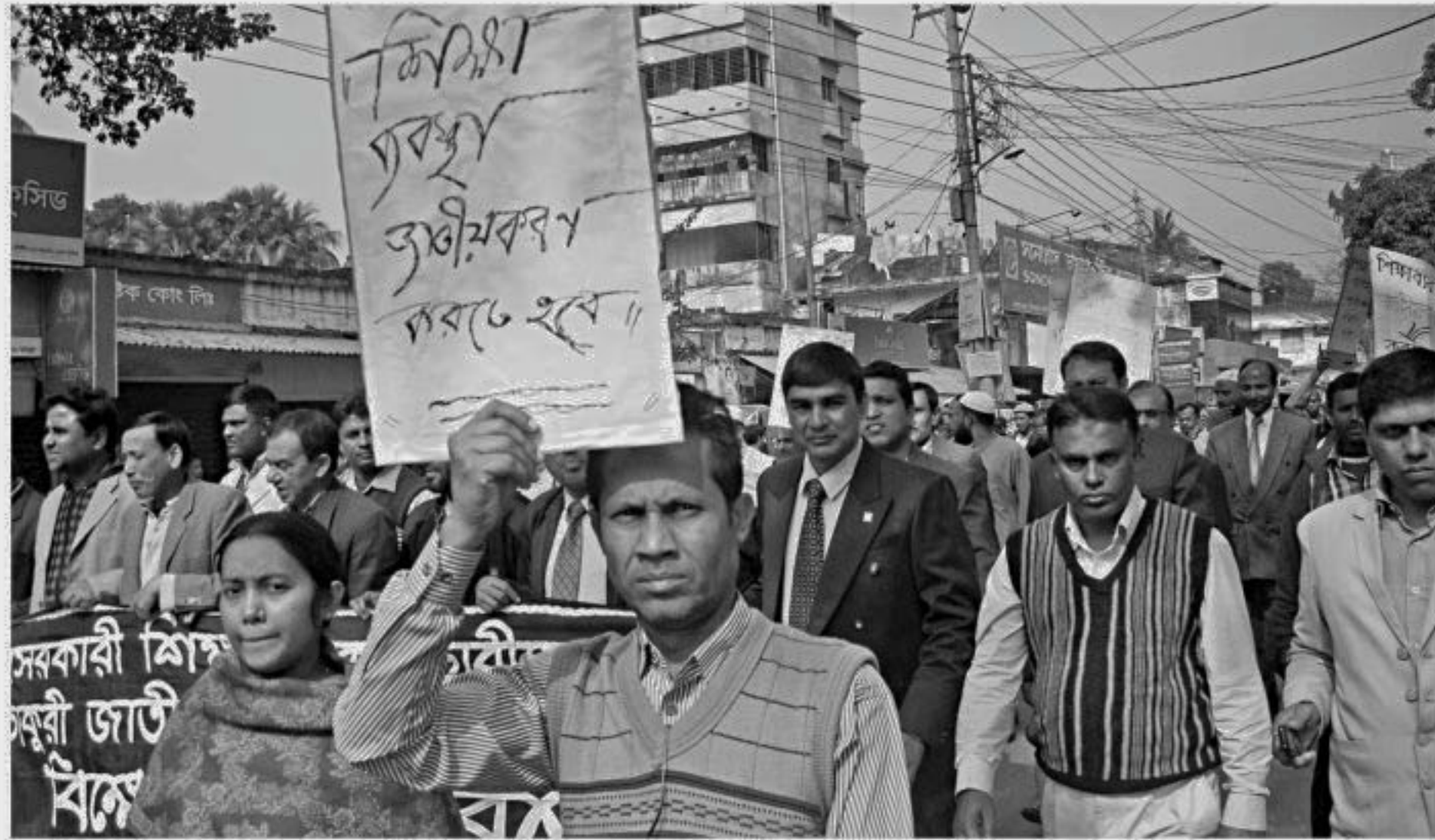
Teachers and employees of non-government schools, colleges and madrasas take out a procession in Mugura town demanding nationalisation of their jobs, right, teachers of non-government primary schools in Thakurgaon bring out a procession in the district headquarters to celebrate nationalisation of their jobs yesterday

A member of Gosmika Gamla Club, based at Darus Salam of Mirpur in the capital, distributes books, slates and warm clothes among the underprivileged schoolchildren at Korhatir Char in Louhajang upazila of Munsiganj district yesterday.