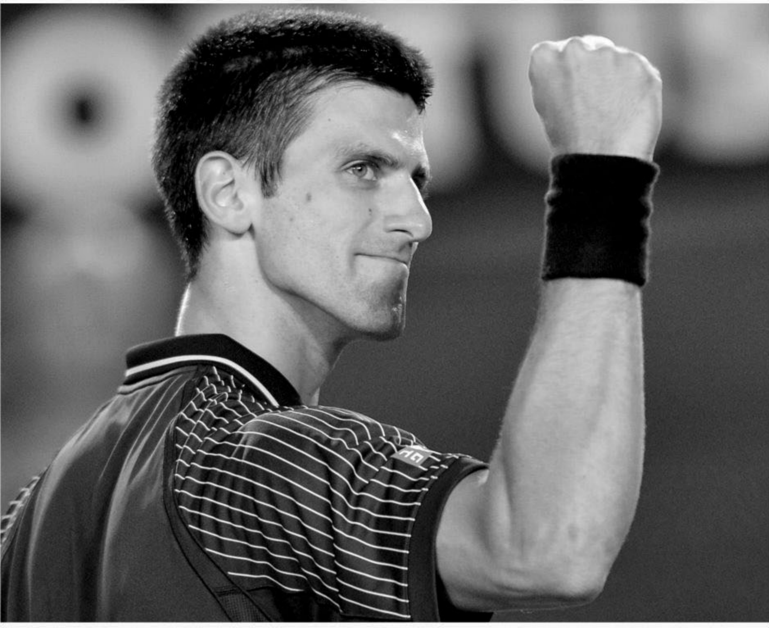
Serbia's world number one Novak Djokovic pumps his fist in celebration after beating American Ryan Harrison in the second round of the Australian Open in Melbourne yesterday.