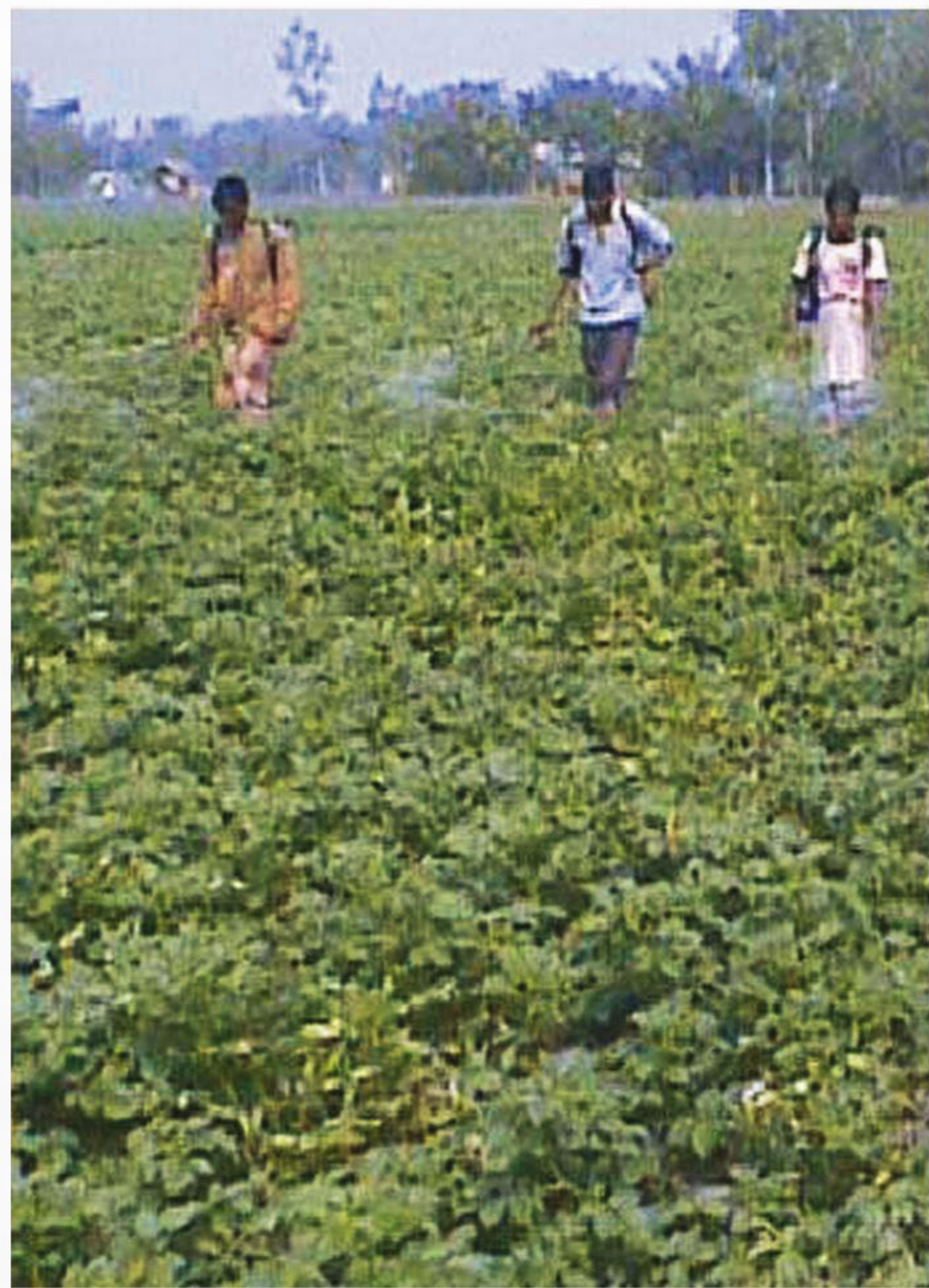
Farmers spray pesticide 'Mancozed' in their potato field at Mondolerhat village of Lalmonirhat Sadar upazila, in an attempt to minimise the effect of late blight disease caused by the unusually long cold wave accompanied by dense fog during the current season.