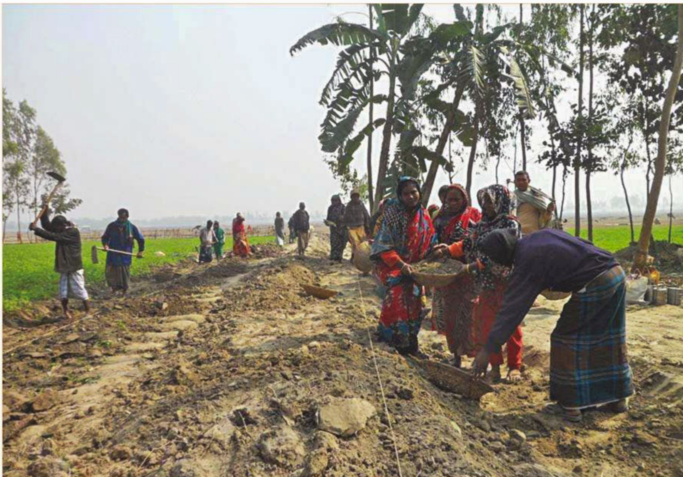
Villagers work to reconstruct the two-kilometre-long earthen road from Gobargari-Adarshapara to Boiragipara in Badarganj upazila under Rangpur district, following recovery of the public path from illegal occupiers after long 70 years.

But shortly afterwards, some influential people occupied the road and built houses, planted trees, and excavated ponds to establish their claim on the land.