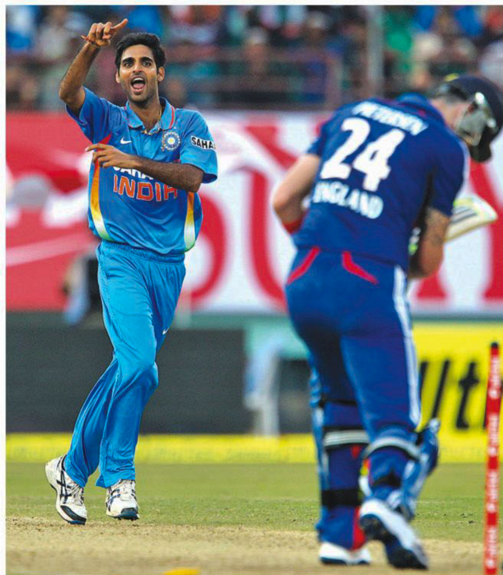
Young Indian swing bowler Bhuvneshwar Kumar exults after disturbing England batsman Kevin Pietersen's furniture. His three early wickets gave India a massive 127-run win in the second ODI at Kochi yesterday.