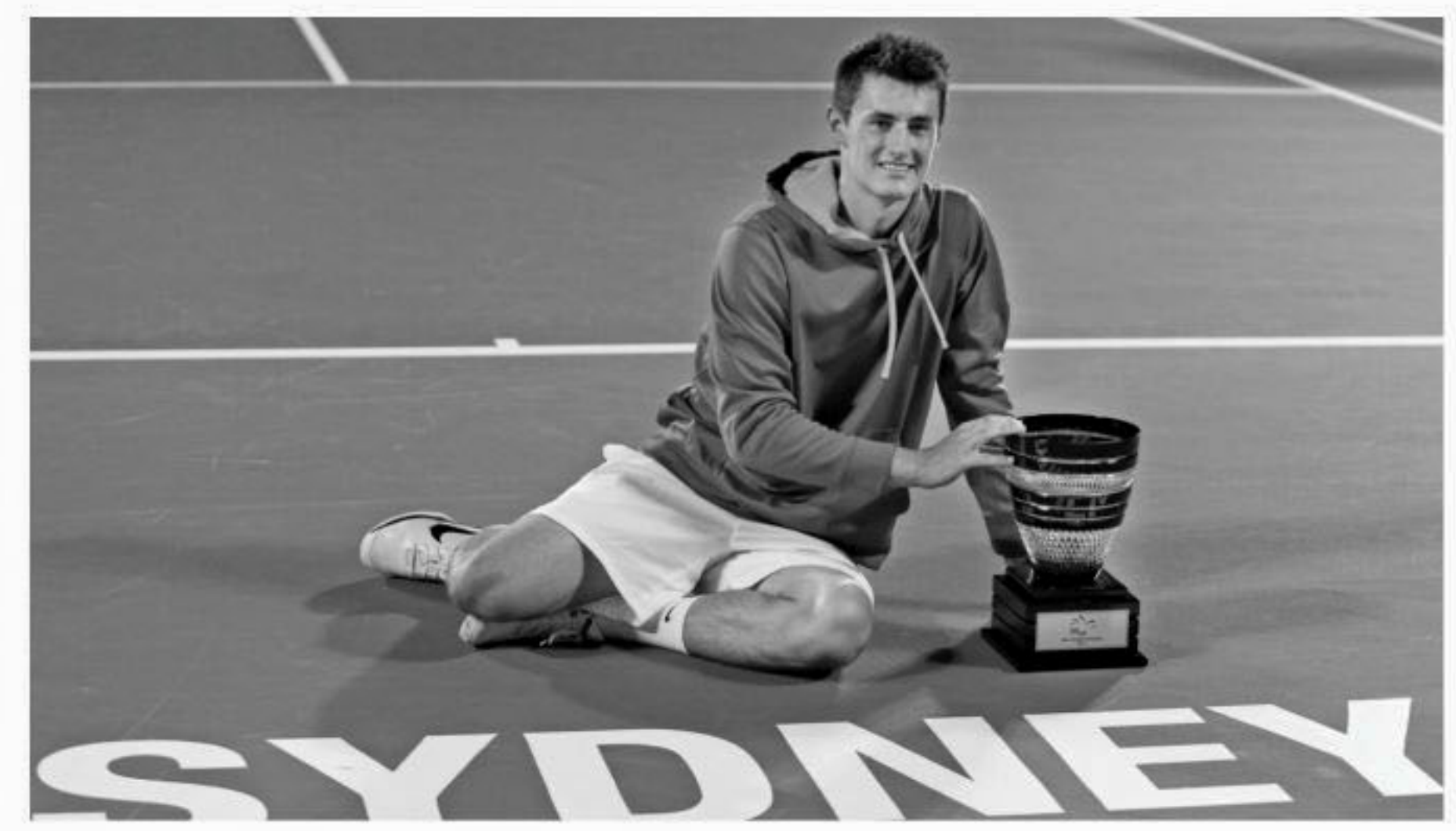
Australian Bernard Tomic poses with the Sydney International trophy after he won the final against Kevin Anderson of South Africa on Saturday.