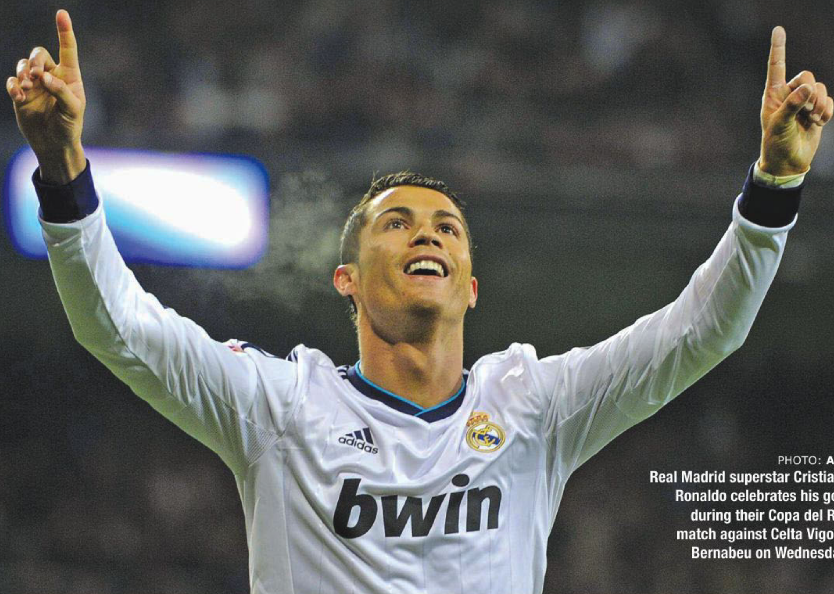
Real Madrid superstar Cristiano Ronaldo celebrates his goal during their Copa del Rey match against Celta Vigo at Bernabeu on Wednesday.

"We want him to have a great career with Santos like the King Pele during his heyday," he told AFP.