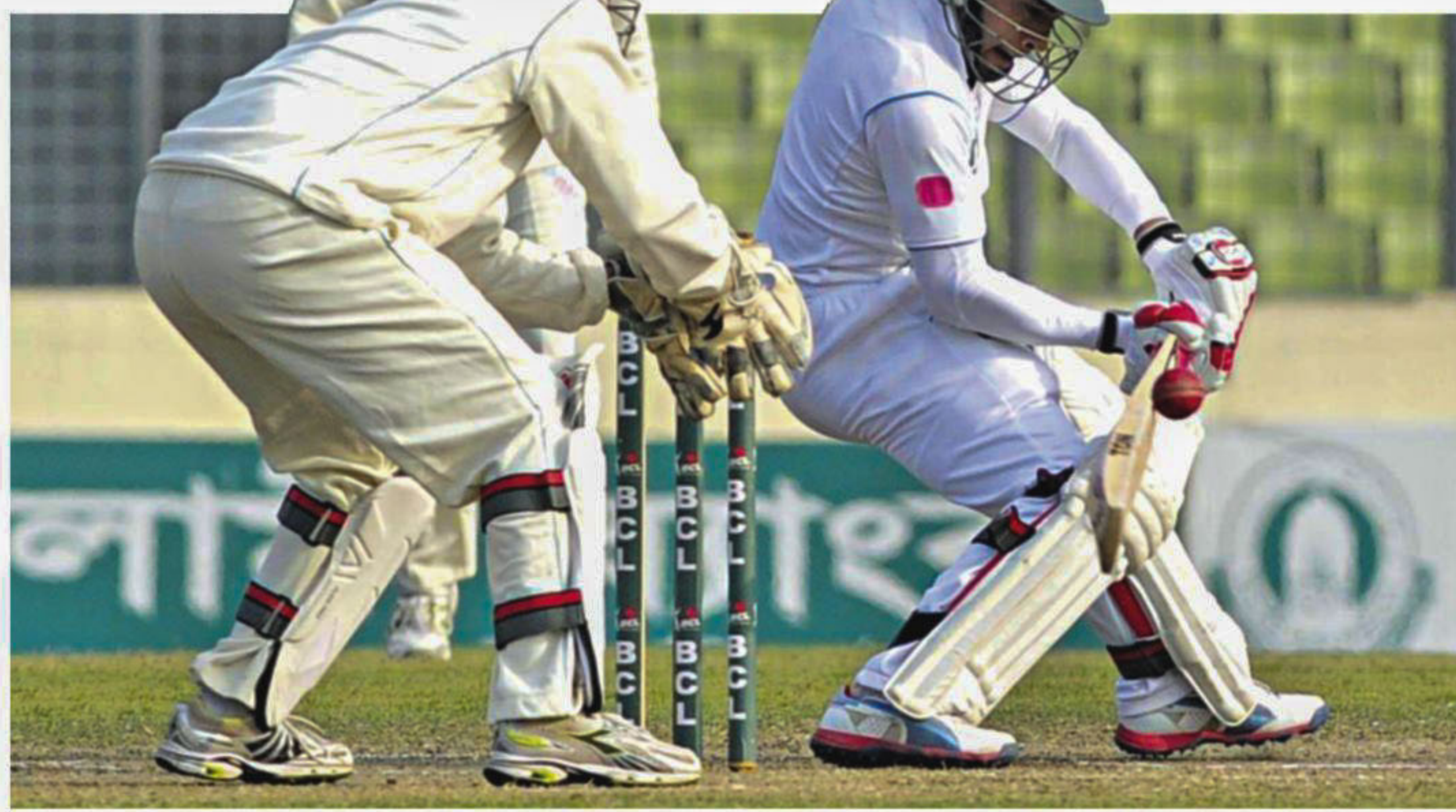
BCB North Zone captain Mushfiqur Rahim plays a square-cut on the third day of the Bangladesh Cricket League match against Prime Bank South Zone at the Sher-e-Bangla National Stadium in Mirpur yesterday.