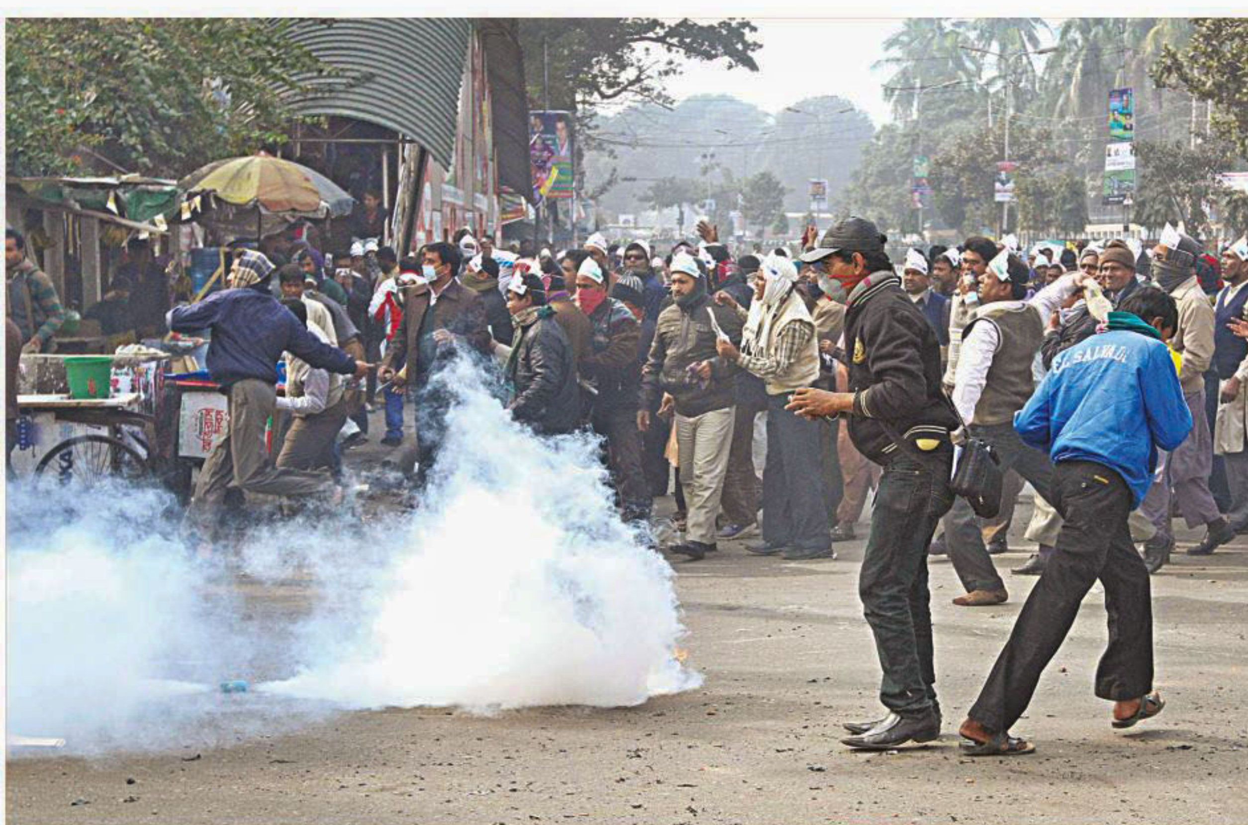
Police fire teargas canisters on demonstrating teachers demanding their schools be included in the monthly pay order. The photo was taken in front of the Jatiya Press Club yesterday.