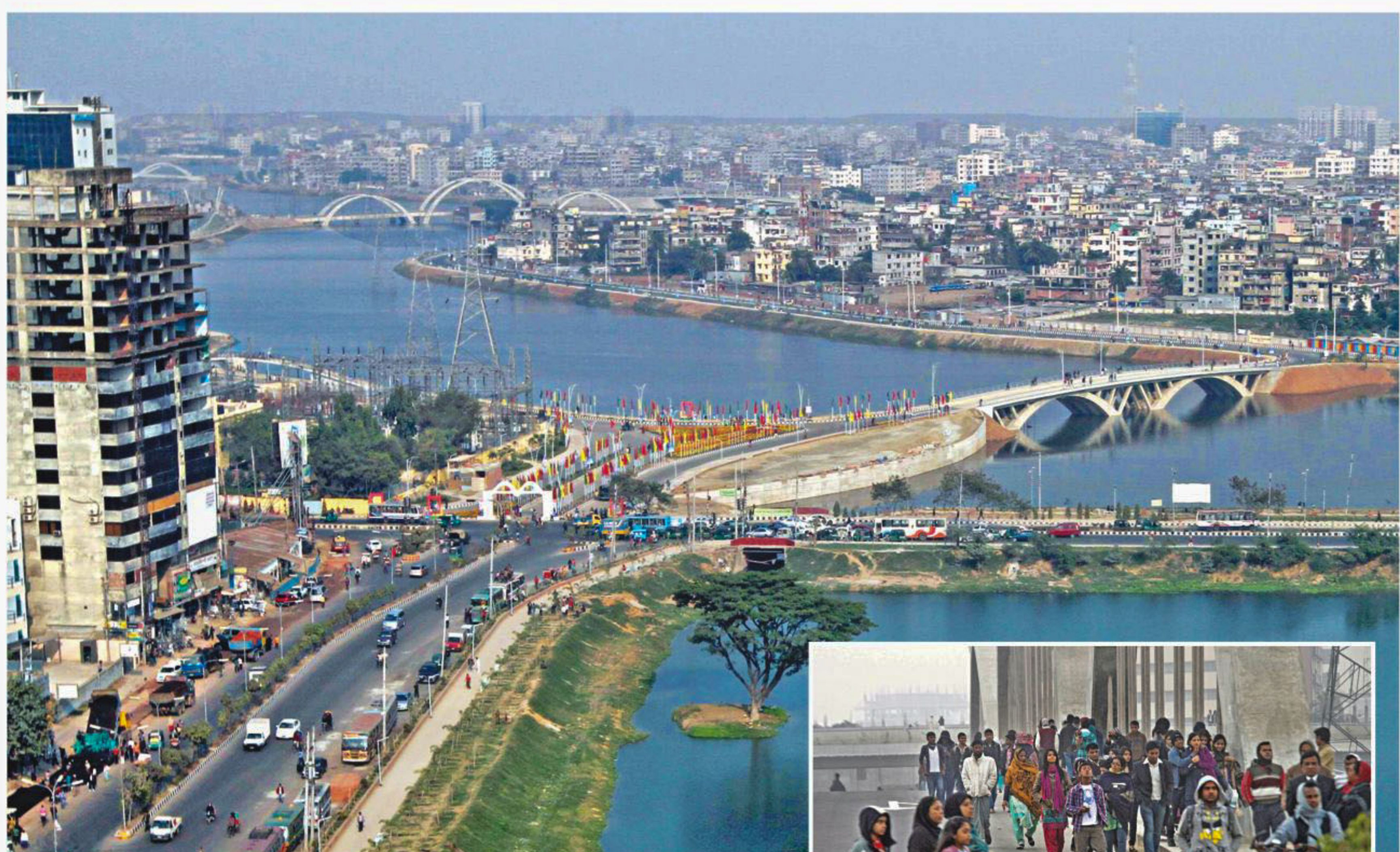
The Hatirjheel project area is open to public since January 2 and with just a handful of parks and recreation centres in the capital, people brave the chilly weather, inset , and visit the beautiful bridges and streets.