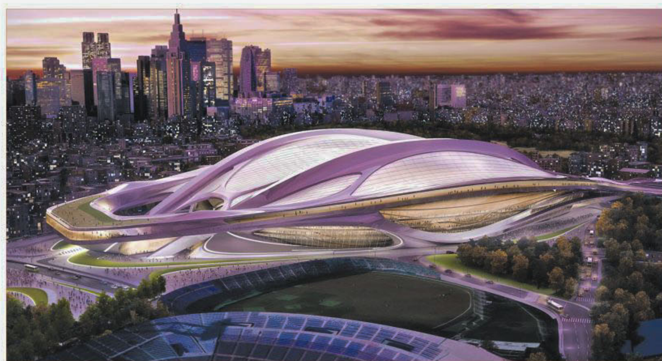
A computer-generated image provided by the Tokyo 2020 Olympic Games Bid Committee shows what the Tokyo National Stadium, which was the main venue of the Games in 1964, will look like when the makeover is done.