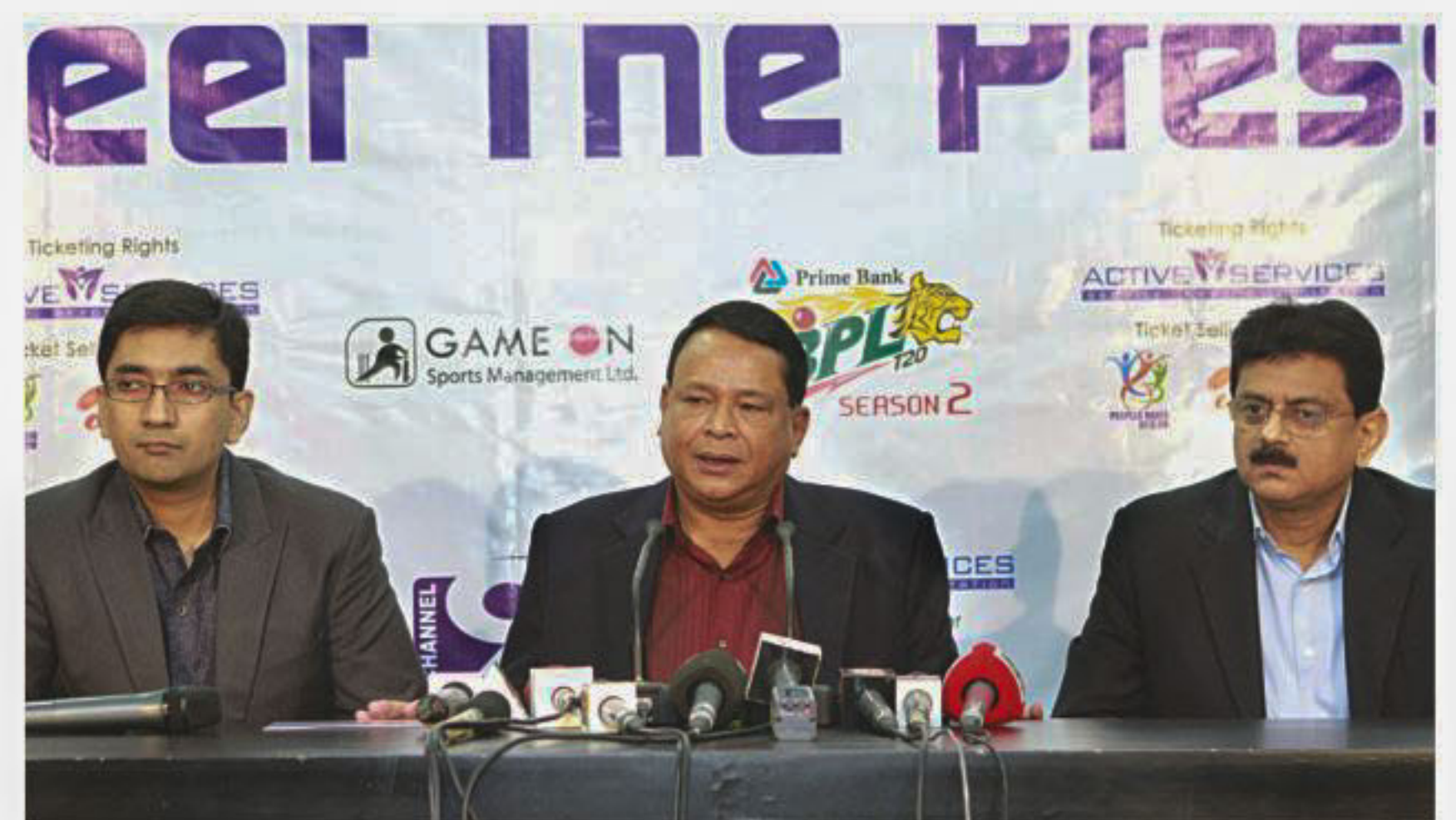
Chairman of Bangladesh Premier League Governing Council Afzalur Rahman Sinha (C) speaks at a press briefing organised in connection with the tournament's ticket rates at the Sher-e-Bangla National Stadium in Mirpur yesterday.