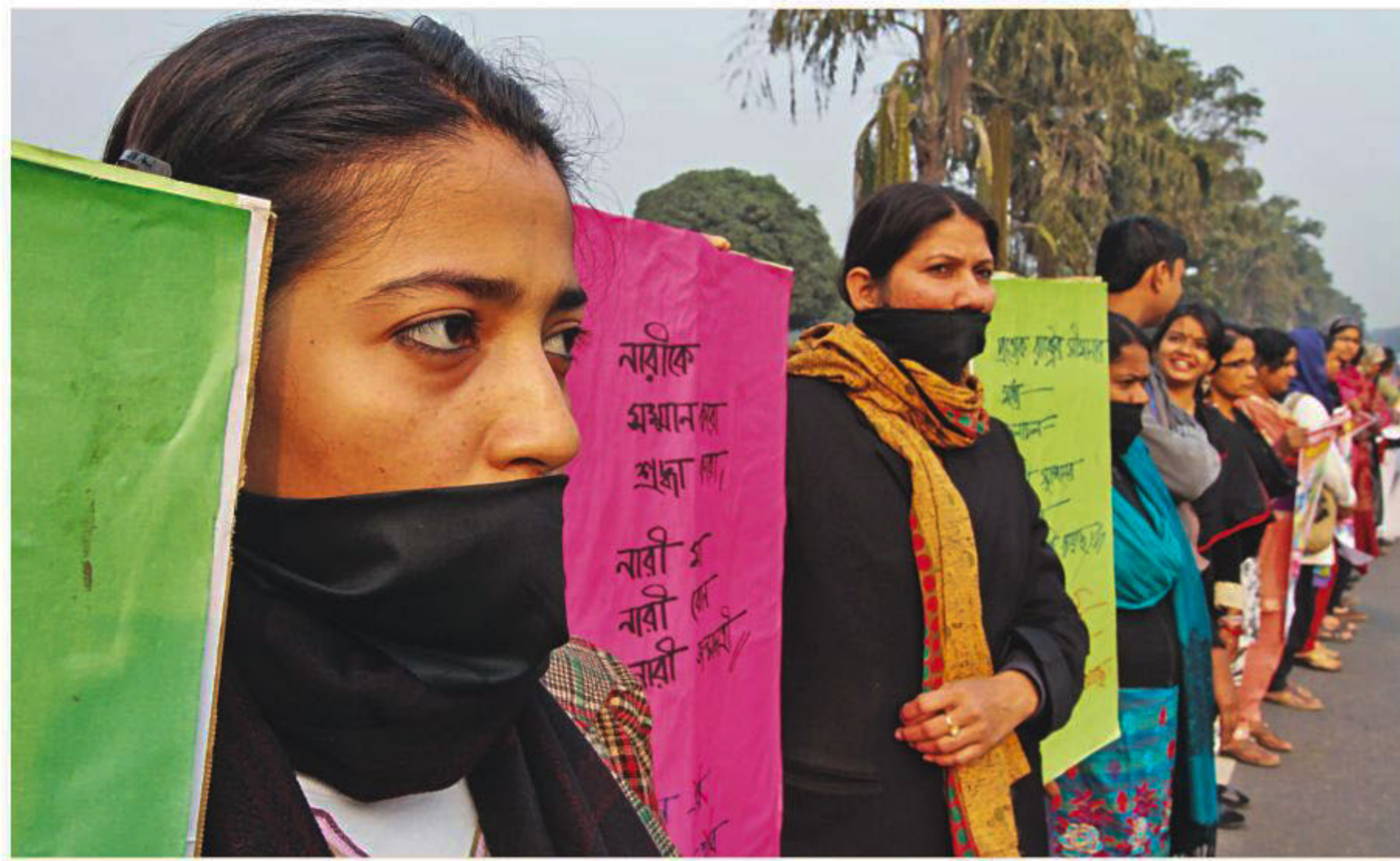
Students, rights activists and civil society members demonstrate with their mouths gagged in front of the Jatiya Sangsad in the capital yesterday to protest the gang rape of a Tangail schoolgirl.