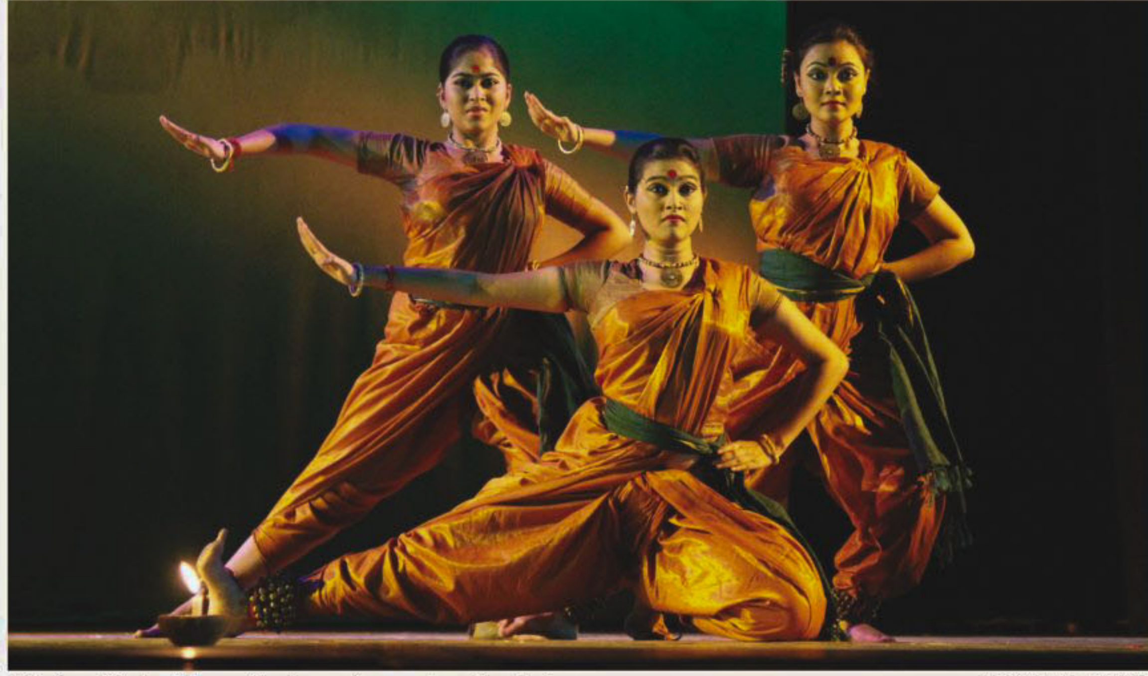
Artistes of Pallavi Dance Centre perform a devotional piece.