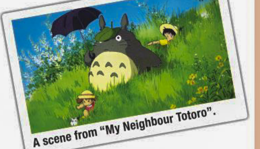
A scene from 'My Neighbour Totoro'.

Featuring 1960s' animation with Beatles' songs, 'Yellow Submarine' has been hailed as one of the successful animated musicals of all time. The film will be screened on January 9 at 6pm.