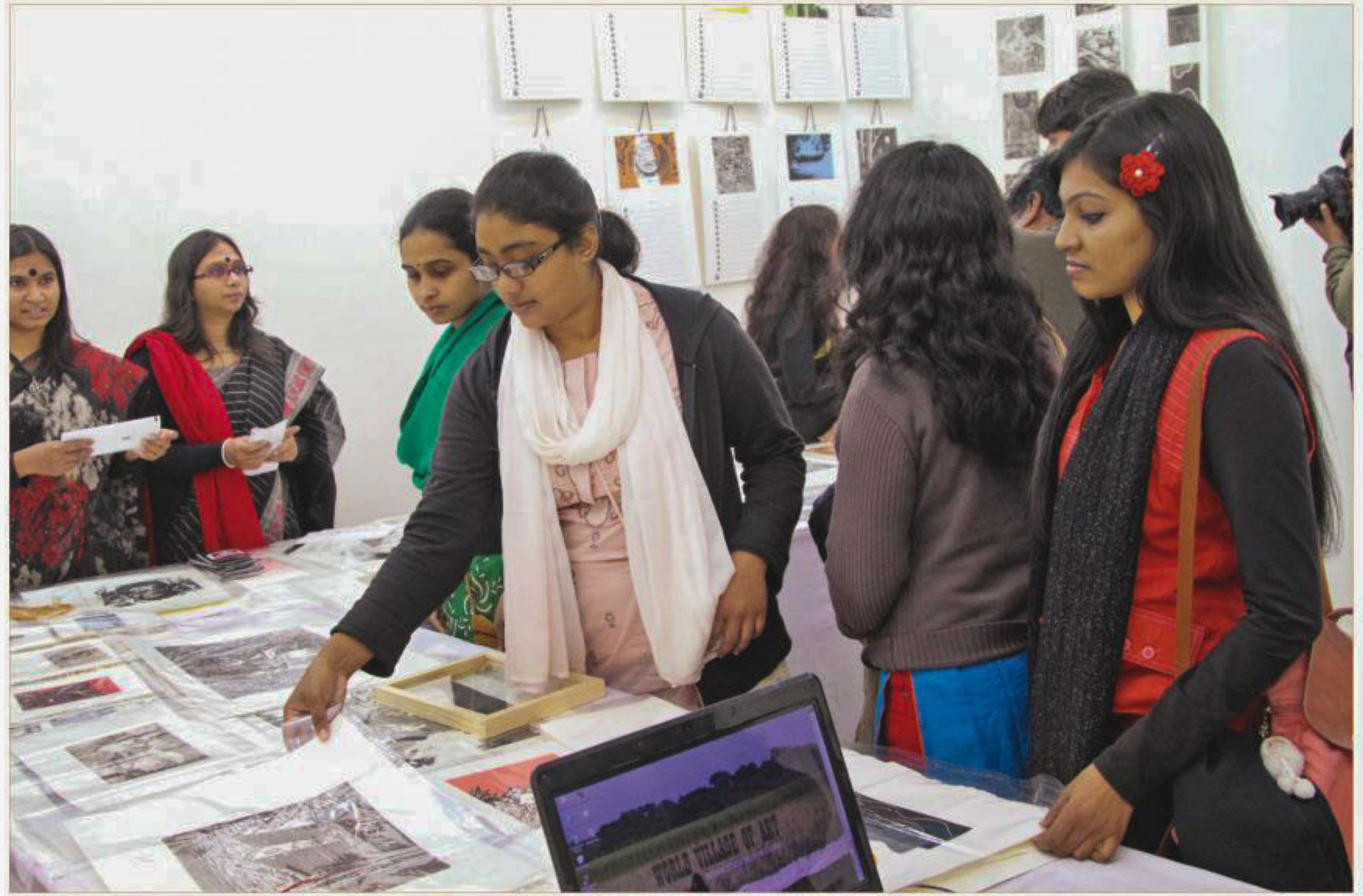
Visitors and printmakers at the fair.