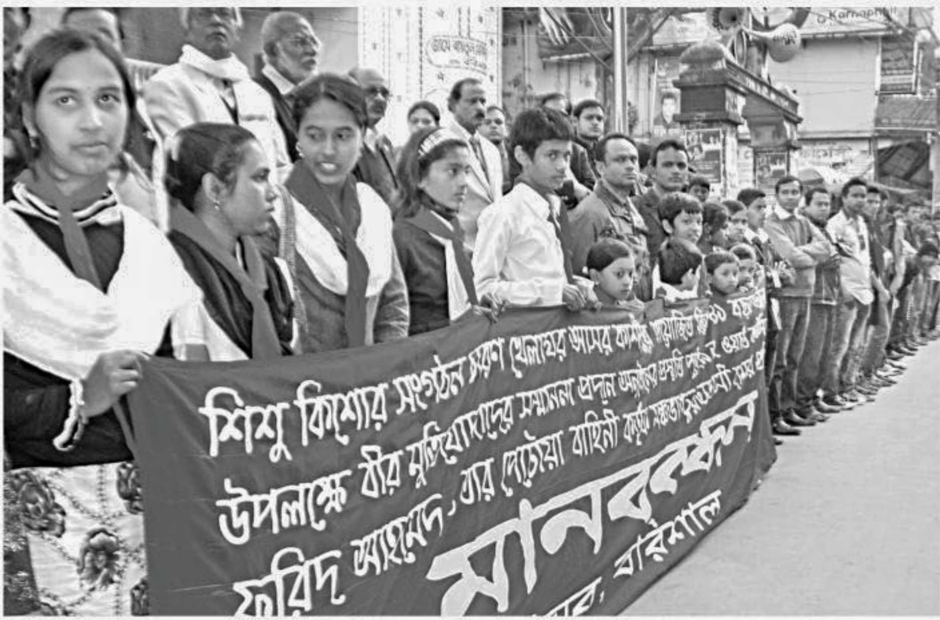
Barisal district unit of Khelaghar forms a human chain in front of the Ashwini Kumar Hall in the city yesterday, protesting an attack on its programme at Ward No 29 by the ward councillor and his men on Tuesday. Khelaghar had arranged the programme to accord reception to the freedom fighters of the ward.