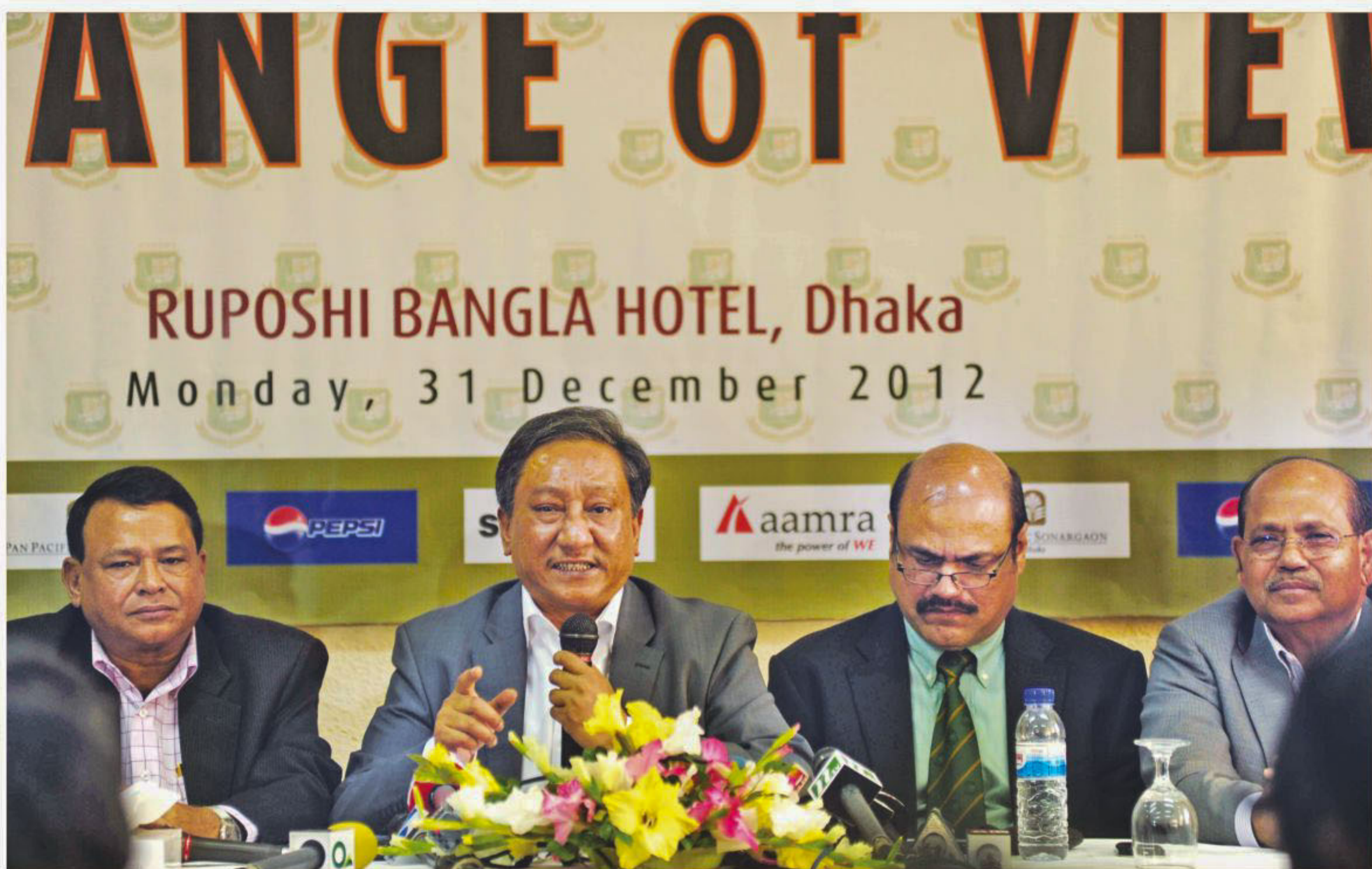
Bangladesh Cricket Board (BCB) president Nazmul Hassan Papon speaks during the Exchange of View programme at the Ruposhi Bangla Hotel yesterday.