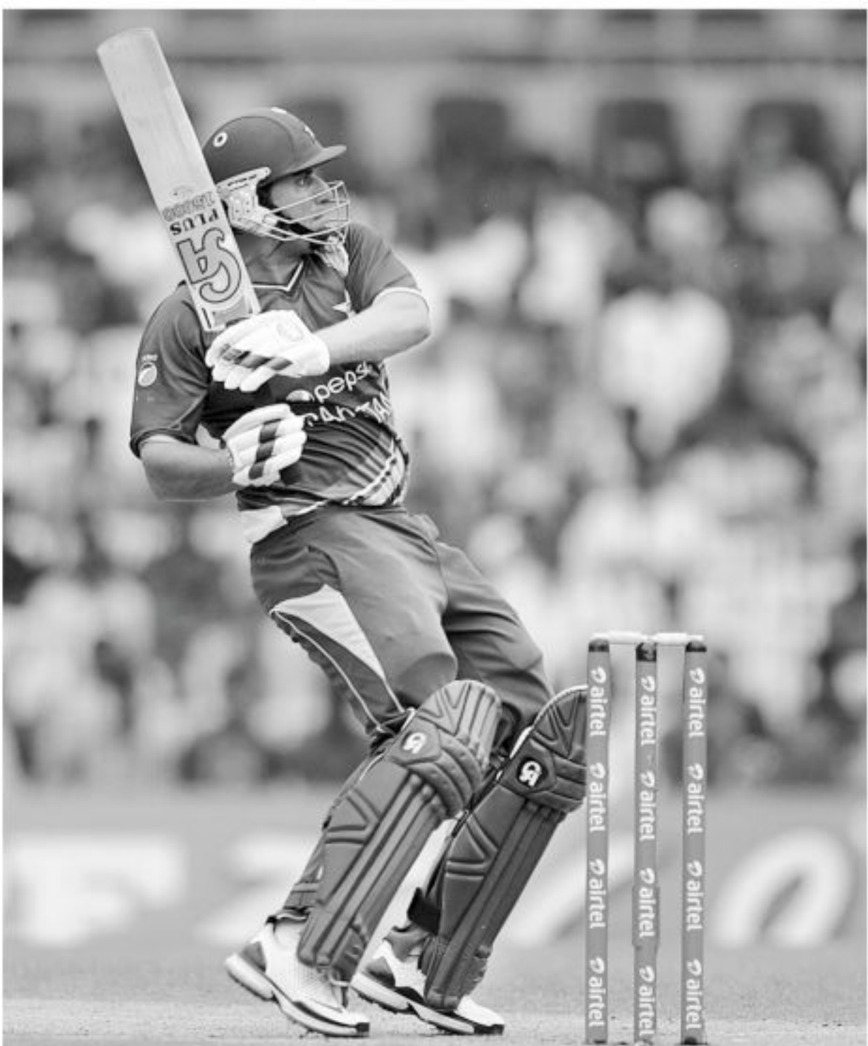
Pakistan opener Nasir Jamshed plays a pull shot during the first one-day international against India in Chennai yesterday.