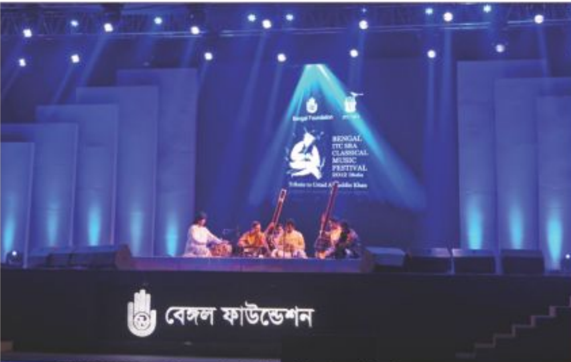
Bengal ITC-SRA Classical Music Festival