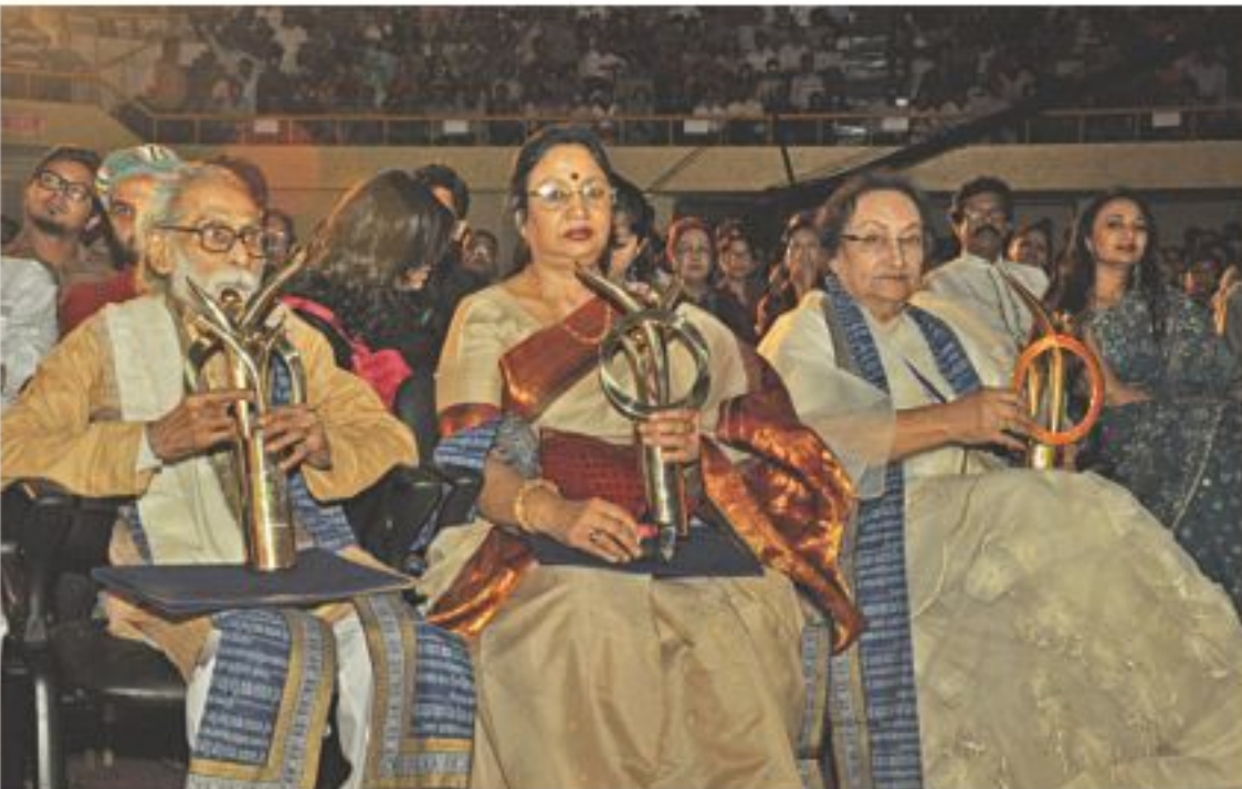
Celebrating Life 2012

Pandit Ravi Shankar passes away Indian sitar maestro Pandit Ravi Shankar died on December 13 in San Diego of United States. He was 92. In many ways the maestro launched Indian classical music at the world stage and showed the world, indeed many in India as well, its sheer power. He re-wrote the rules of Indian classical performances and took it beyond its traditional and limited boundaries. Pandit Ravi Shankar was a humanist with a deep sense of concern for the oppressed and deprived. He, along with Ustad Alla Rakha, performed at the Concert for Bangladesh in Madison Square Garden, New York City in 1971 and was one of the key movers, along with George Harrison, of this landmark concert.