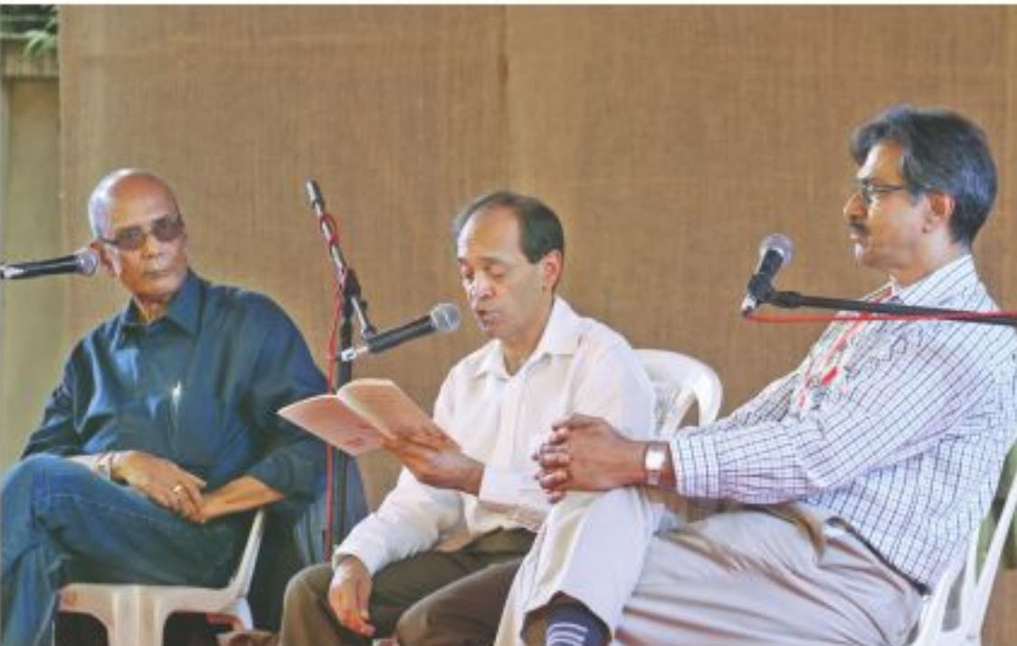
Hay Festival 2012