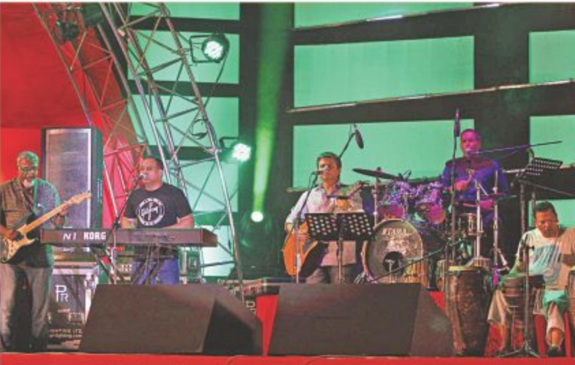
Odmmo Chattagram Festival

Dok Leipzig, in Germany. The film was also nominated (among 12 films from all over the world) for the festival's 'International Documentary Competition'. The weeklong festival began on October 29. "Shunte Ki Pao!" zooms in on a small village near the Sundarbans. It was the first film from Bangladesh invited to the 'Editing Lab' of 'Campus Studio' at Berlinale 2012.