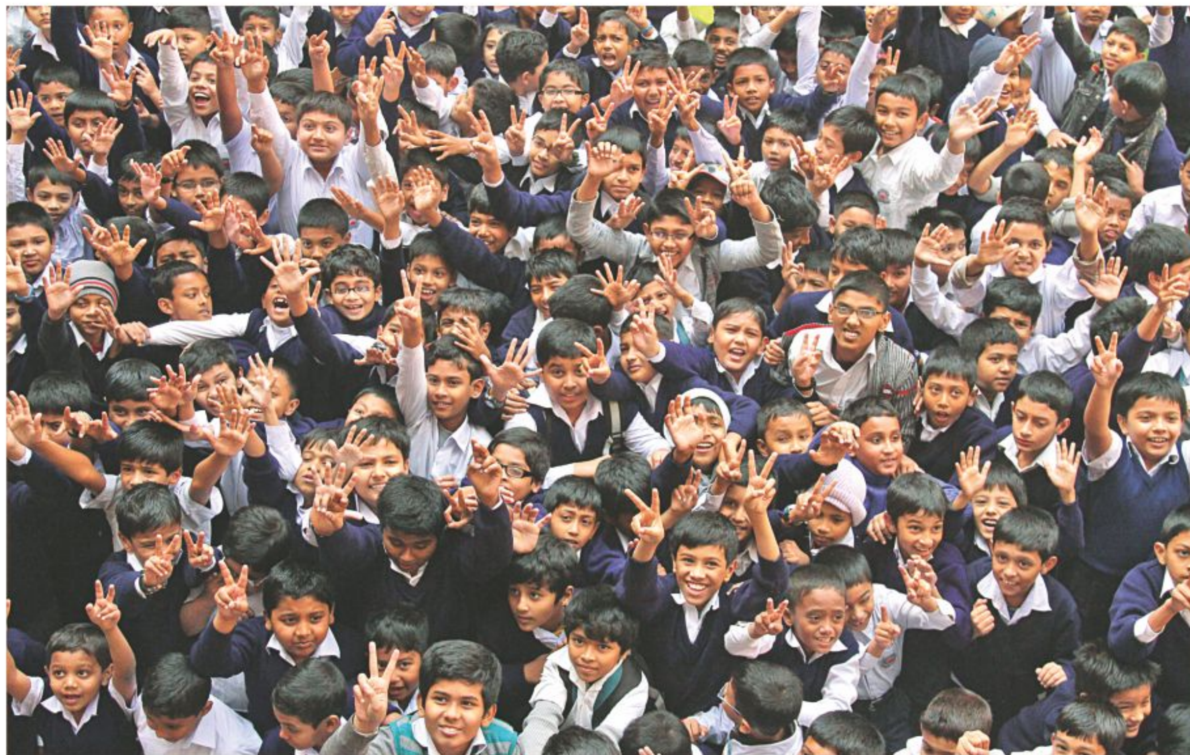
Students of Monipur High School and College of Mirpur in the capital rejoice yesterday after their school became the best nationwide in the primary terminal exam results. More photos on page 2, 5.