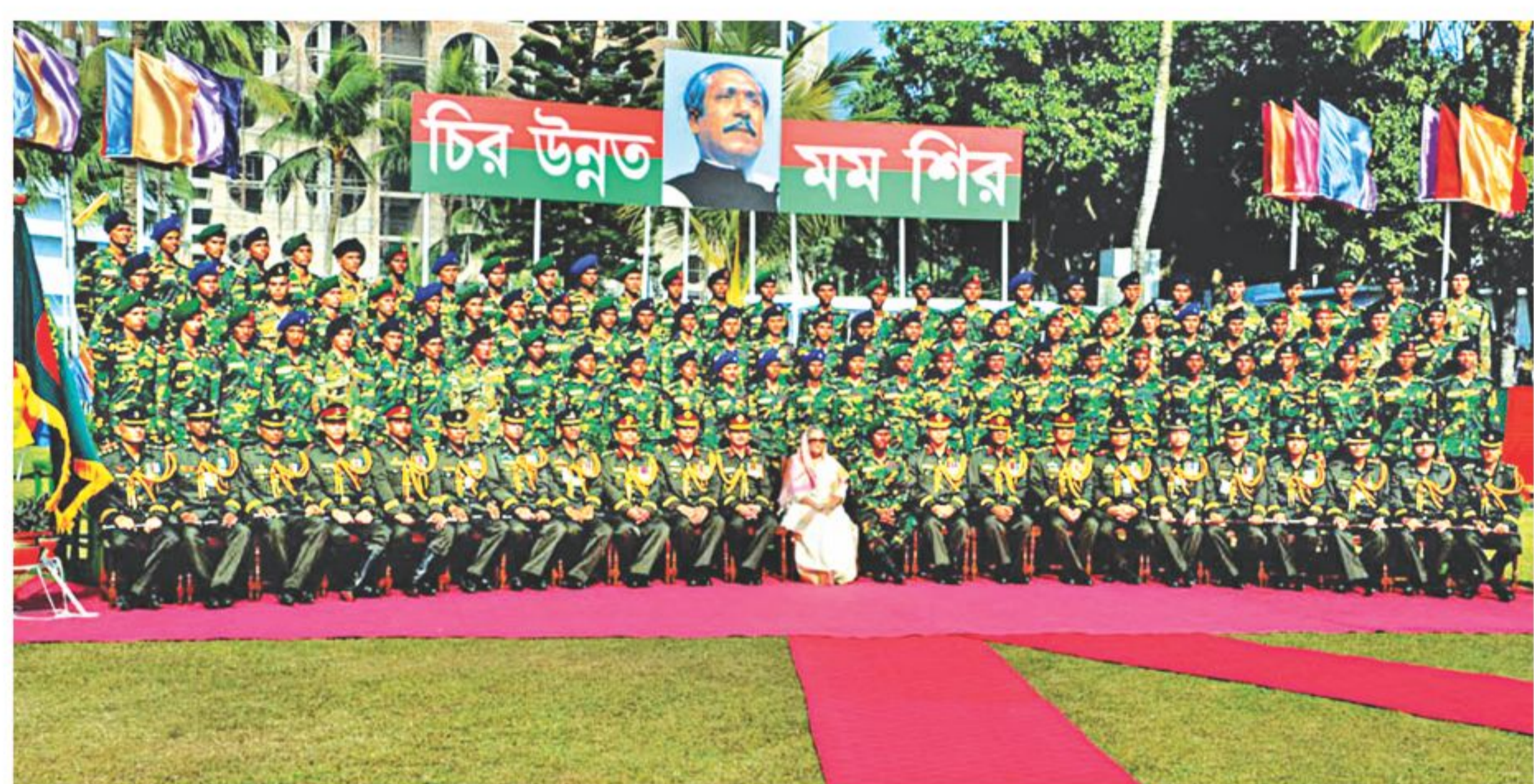
Prime Minister Sheikh Hasina with the newly commissioned cadets of the 67th Long Course and 38th Special Course of Bangladesh Military Academy in Bhatiary of Chittagong yesterday.

He underlined that his country highly values the relations with Bangladesh and expressed hope that the existing friendship and cooperation between the two countries would be enhanced in future.