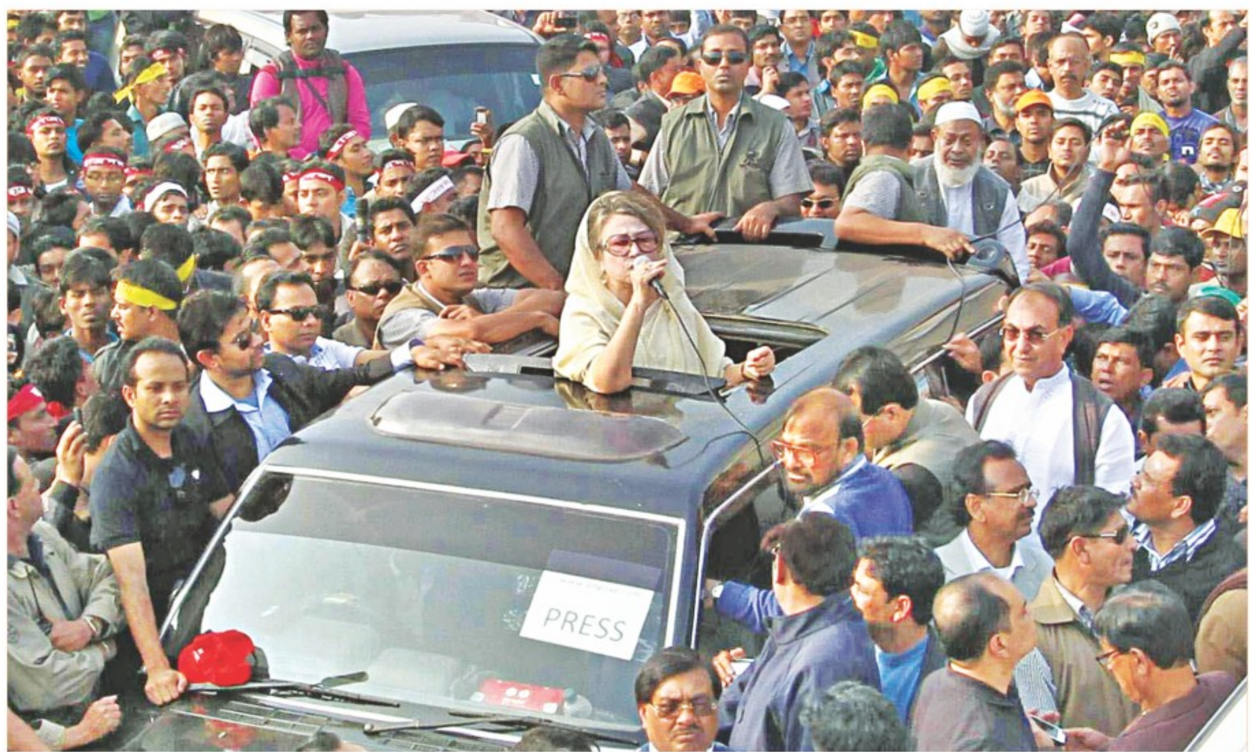
From a vehicle marked press, BNP chief Khaleda Zia speaks at a rally in Dholai Khal during the opposition's mass contact campaign in the capital yesterday. Another photo on page 2.