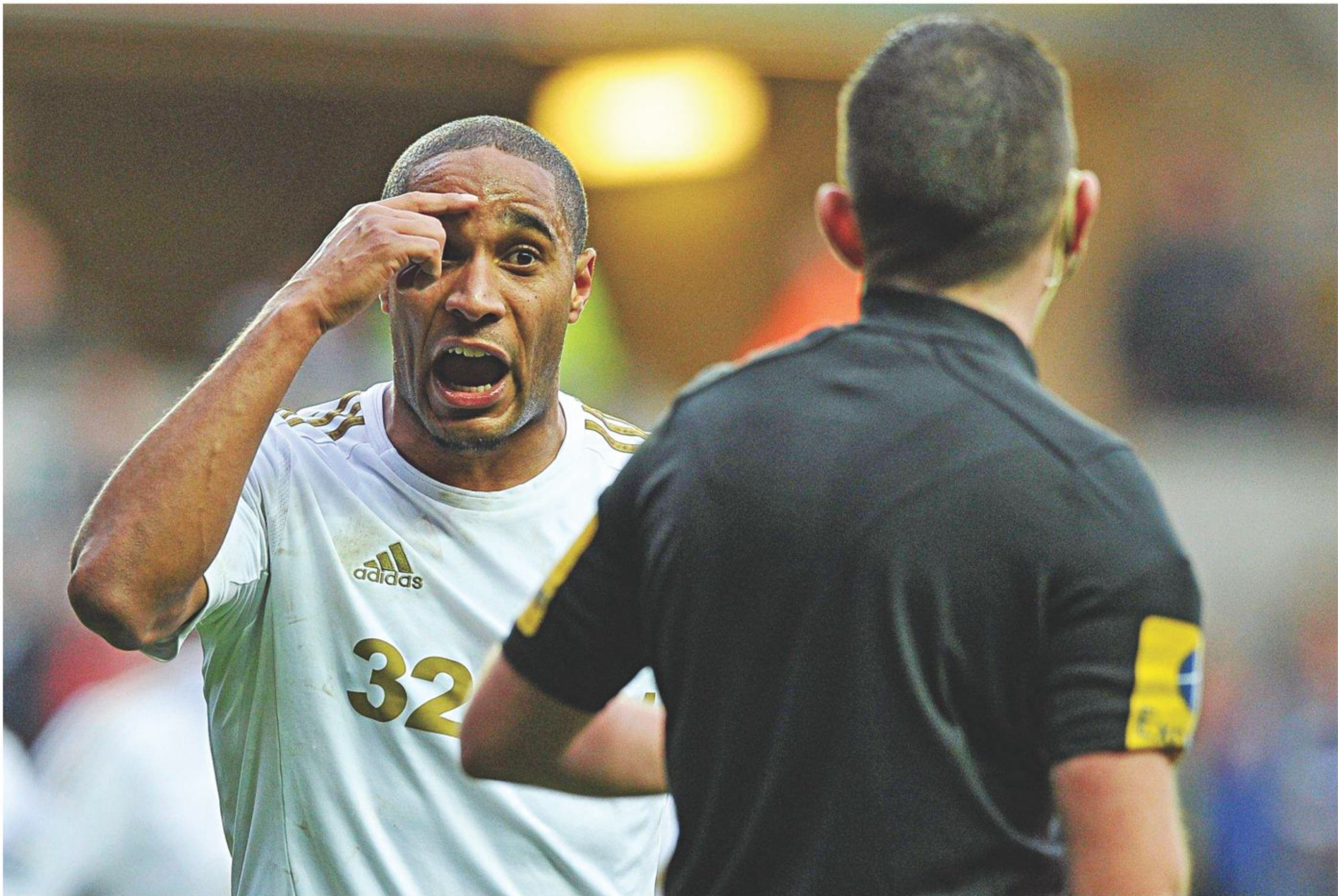
Swansea defender Ashley Williams (L) gestures after being booked for clashing with Manchester United striker Robin Van Persie during their Premier League encounter at the Liberty Stadium on Sunday.